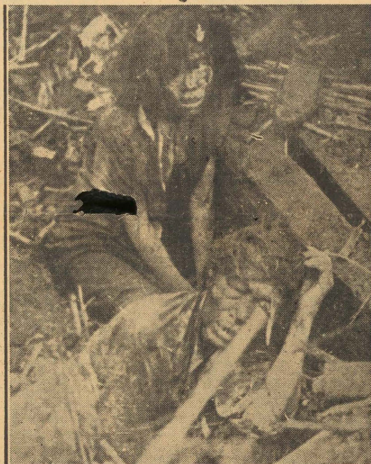
Mother and daughter victims of the American war of aggression.

The people of South Africa, especially the ten million op-