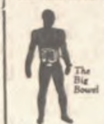
The Big Bowel is where Constipation arises. In this large pot masses accumulate which should be passed out each day.

In every factory, every workshop and every kitchen there is some rubbish left over. Just so with the HUMAN BODY. The Stomach and the Liver turn the food into Blood, flesh and energy, but they leave much waste over. If this waste is not cleared away the body is poisoned. INTESTONE is a medicine which clears away the Slime in the Stomach, the excess of Bile and the masses of poisonous rubbish which lie in the Bowels. INTESTONE contains herbs and fruits for this purpose but it also contains chemicals for cleansing the Blood Stream. This is why it clears the coated tongue, removes pimples from the face and rash from the skin.