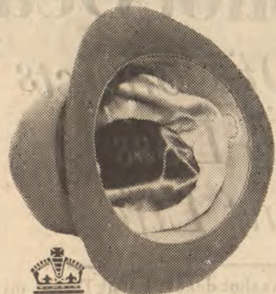
The Coronation Hat