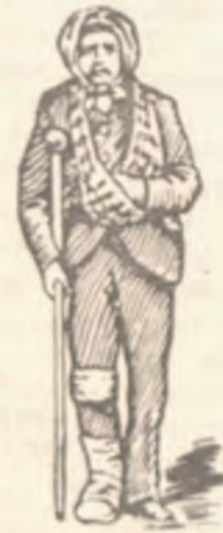
Leha mo raphahlang aha- ane sa mona o tsamaang ka diteng.

JONES' RHEUMATICURO esetse ena le dingoga tse di fetang 60 e nte e rekisoa mo South Africa. E itsiwe thata haele molemo o siameng. Batho ba ba setseng ba na le lobaka bale mo malaong a bone, ba palwa ke go baa lonao ha fatsho, ba bonye go