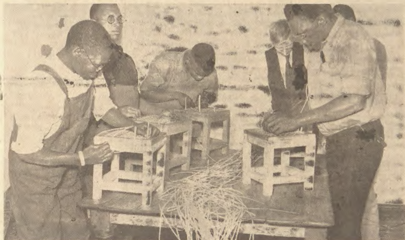
NON-EUROPEAN BLIND BEING TAUGHT SKILLED TRADES IN JOHANNESBURG