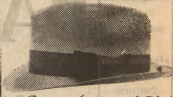
The Prince Imperial Hat