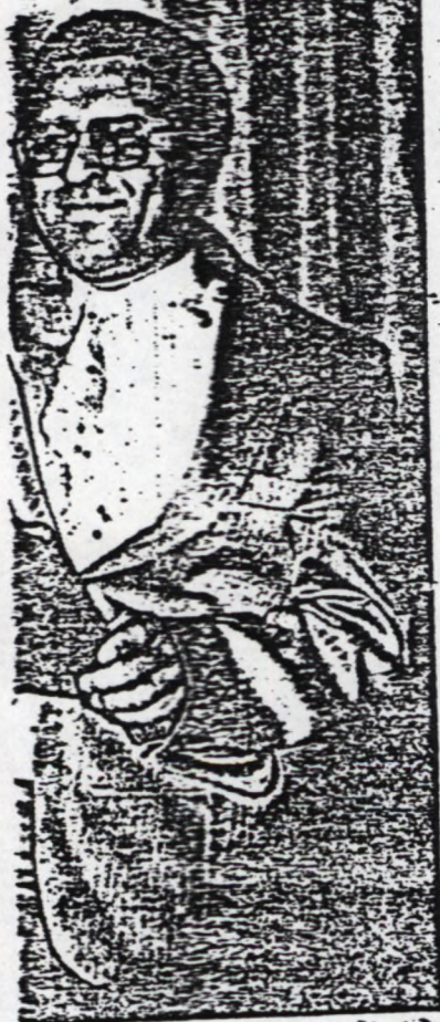
Solidarity with the peoples' struggle for democracy

beautify our so-called Coloured areas and our so-called Indian areas, but do we really want beautiful 'Coloured' and Indian areas? We don't want beautiful