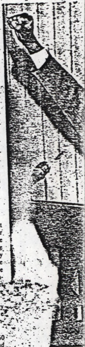
Boesak raises his fist to

we be grateful because we get library? They must not take things away from the people which are theirs. Give them back to them and then