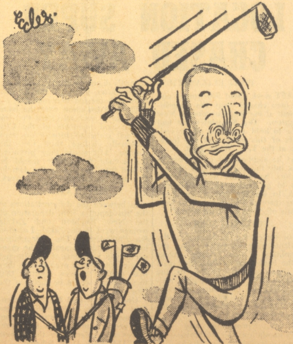
"THERE'S A RUMOUR HE'S GOING TO RETIRE AND TAKE UP POLITICS."

The only condition was that they should "adopt Africa as their home and become African."