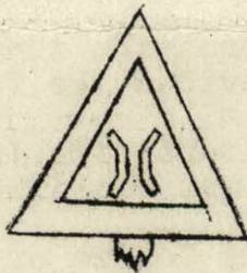
SMAL BRUG NARROW BRIDGE