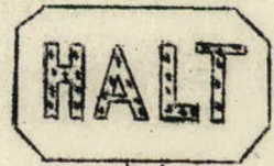
OORWEG STIL- HOUTEKEN LEVEL CROSSING HALT BOARD