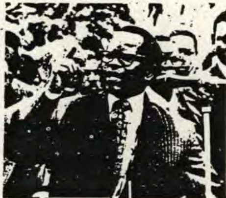
President Tambo at the funeral

Apartheid is the system that maintains 23 million people oppressed, humiliated,