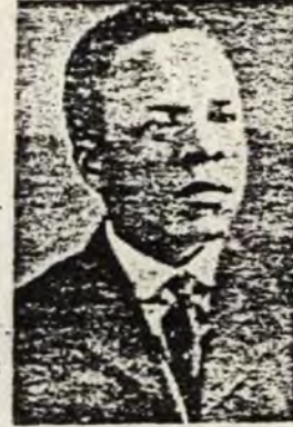
Amongst the founding fathers were, from left to right: King Dinizulu, John Dube, Charlotte Maxeke and Sol Plaatje.

(Extracts from a statement of the National Executive Committee of the African National Congress on the occasion of the 70th anniversary of the formation of the African National Congress — January 8th, 1982. For the rest of the statement see MAYIBUYE No. 1 Supplement.)