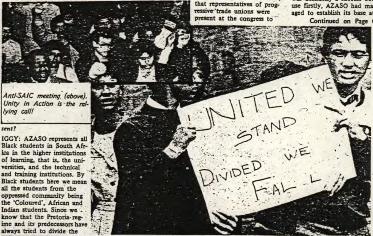
Anti-SAIC meeting. (above). Unity in Action is the rallying call!

RAEVELL: In order to answer this question it is important to place this conference in its proper context. During the time that the congress was taking place, there were a number of important actions—not only MK actions but also squatter resistance to forced removals, and increased worker action. Therefore, these actions gave the congress a special nature in that representatives of progressive trade unions were present at the congress to