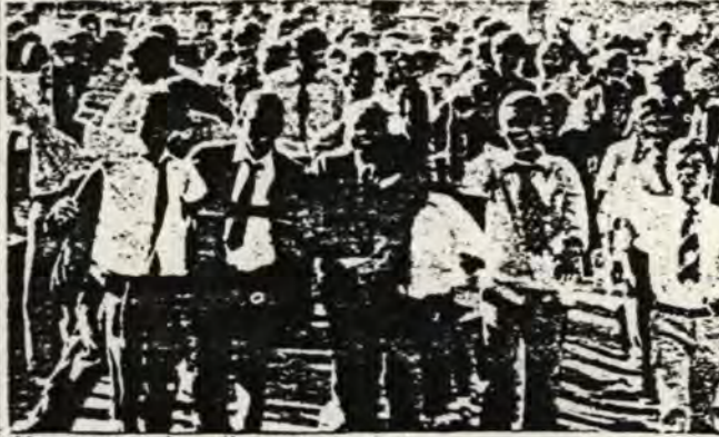
Mass action by all sections of the oppressed and democratic forces is a prerequisite for victory.

society. We must know that it is impossible to get rid of this racist educational system until the whole system of apartheid and its exploitative nature has been radically changed. Educational struggles have to be seen in this context.