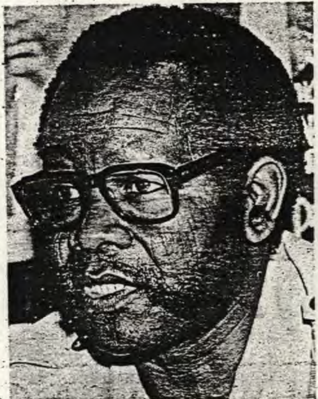
COMRADE PRESIDENT O. R. TAMBO

The ensuing debate and deliberations culminated by a unanimous decision, in the epoch-making formation of the African National Congress. The people of Southern Africa had thus forged a new and mighty weapon of struggle, a regional political force, a national movement which grew to become part of the people's political life, experience and history; the embodiment of their