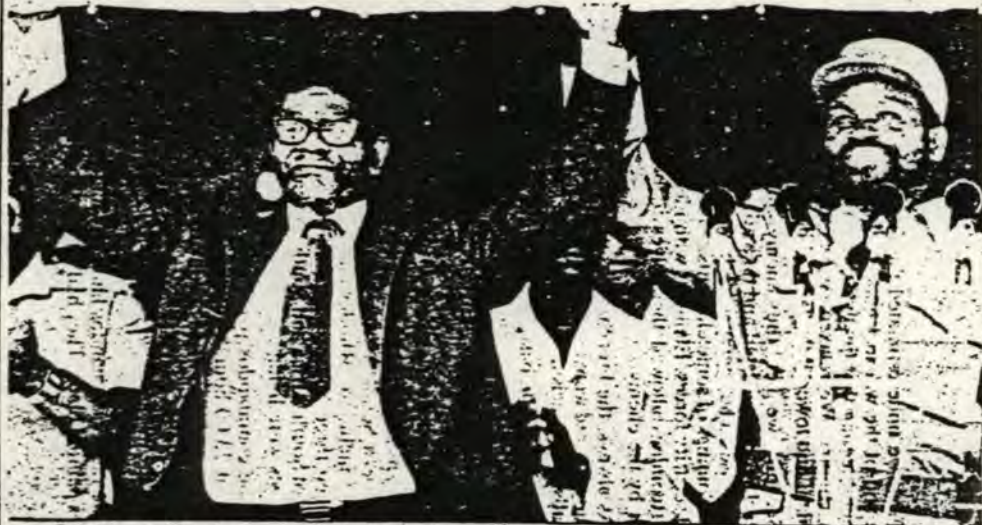
Presidents Tambo and Machel at the rally on the 4th of February, 1981.