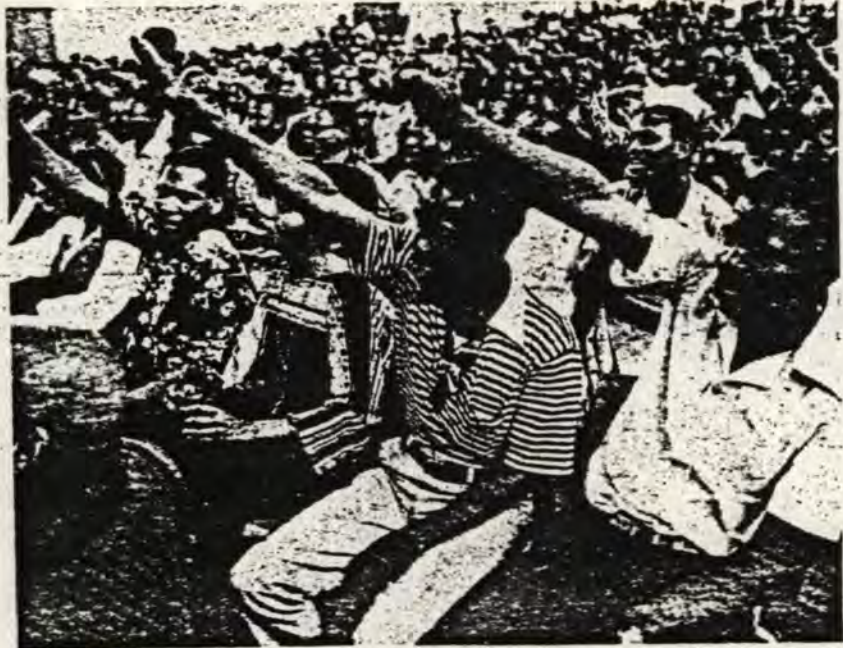
WORKERS AT A TRADE UNION MEETING: "The backbone of our liberation movement".

tion of the struggle. It is the hope of the millions of your brothers and sisters held prisoner by the Pretoria regime that this year you will, together with them, take initiatives further to advance our united action.