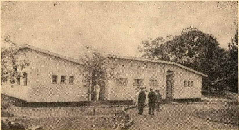
The New Nurses' Home — Opened November, 1953.