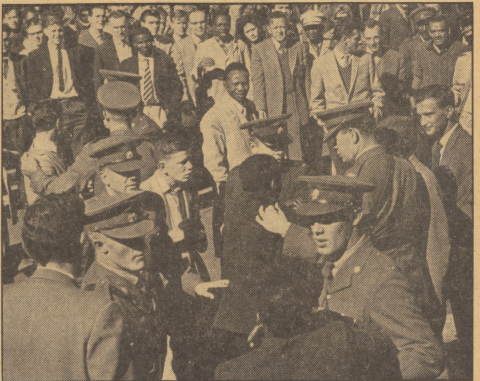
The thugs attacked, and the police waded in—on the side of the thugs. (See story on page 6.)