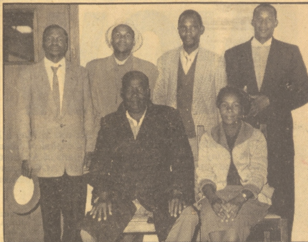
THE BECHUANALAND delegation to the recent Freedom Fighters' Conference held in Accra returned home last week to carry on the struggle for independence and full democratic rights. The delegation is seen here posing for our photographer at Jan Smuts airport, Johannesburg on their return from Ghana.