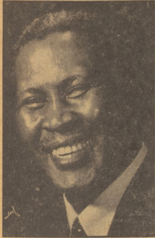
Chief A. J. Lutuli