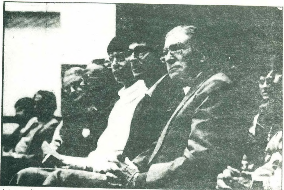
Opening night platform (l-r)