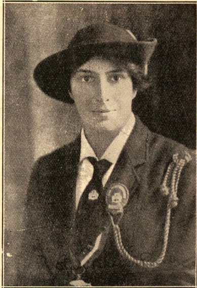
The Lady Baden-Powell, Chief Guide.