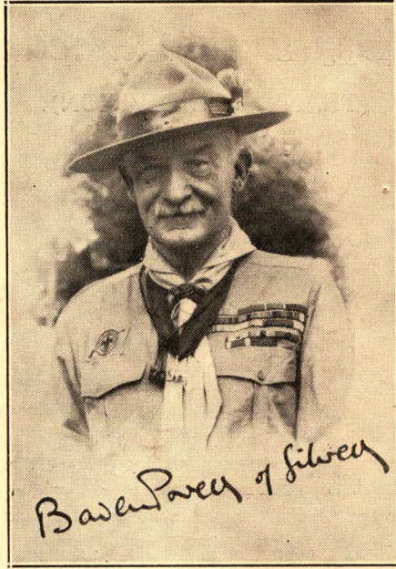
The Lord Baden-Powell of Gilwell, Chief Scout.