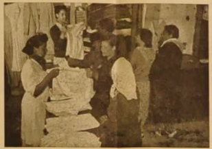
A Clothing Sale