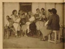
Mothers at CAFDA Village discuss problems