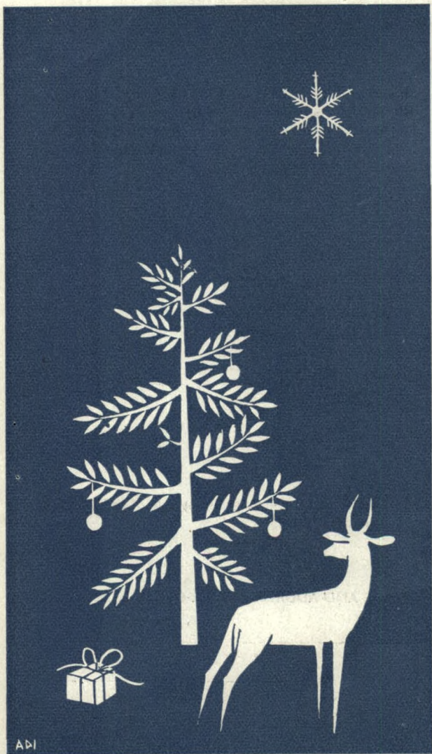
This is the illustration on the cover of the 1957 Cafda Christmas Card. See details on reverse.