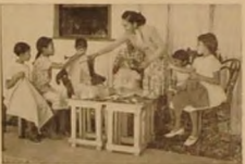
A Girls' Club at work

Group activities in a renovated and furnished cottage at Jersey Park run especially for the residents of CAFDA Village last year included a Boy's Club, a Girls' Club, a Girls' Dancing Class, an Adult Dramatics Group, an Adult Sewing Class and a Concert Group. Some of these groups were led by residents of the Village and others by voluntary helpers from outside. There was much enthusiasm over the activities, particularly among the junior groups and all, except one, continue to flourish this year. The culminating event of the year was a concert and variety play produced, with very little help, by two residents of the scheme and watched by almost 300 residents. Retained and produced in only six weeks, this concert showed how much talent there is in the scheme and how people working together can benefit each other in the field of human relationships. In addition to these, the usual Boy's Club, Football Club, Chess and Music Services were conducted at CAFDA itself. Attendances have been good and enthusiasm high. The sports field was used by a number of schools and other unions and is being much further developed during 1957.