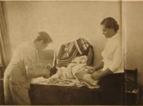
Volunteer Workers make Layettes