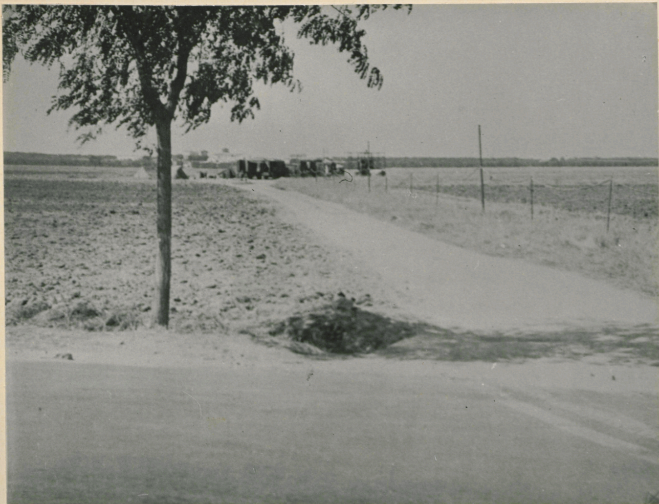
RADAR STATION 899 AMES OPERATED BY NO. 70 FIELD RADAR SECTION, S.S.S., S.A.C.S.