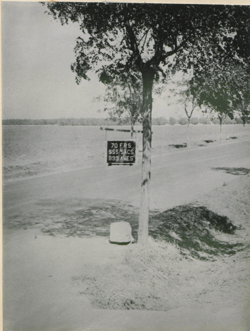
A ROAD SIGN IN ITALY SHOWING THE WAY TO ONE OF THE SOUTH AFRICAN OPERATED RADAR STATIONS.

This programme of planning, training, building, installing and operating continued at top speed until the beginning of 1944, when the war situation had altered sufficiently to lessen the threat to the Union coast. Attention was then focussed on assistance to the campaigns in Europe, and this took the form of airborne radar in South African Air Force squadrons, the supply of ground crews to radar stations in Italy and the supply of technical personnel to the middle east.