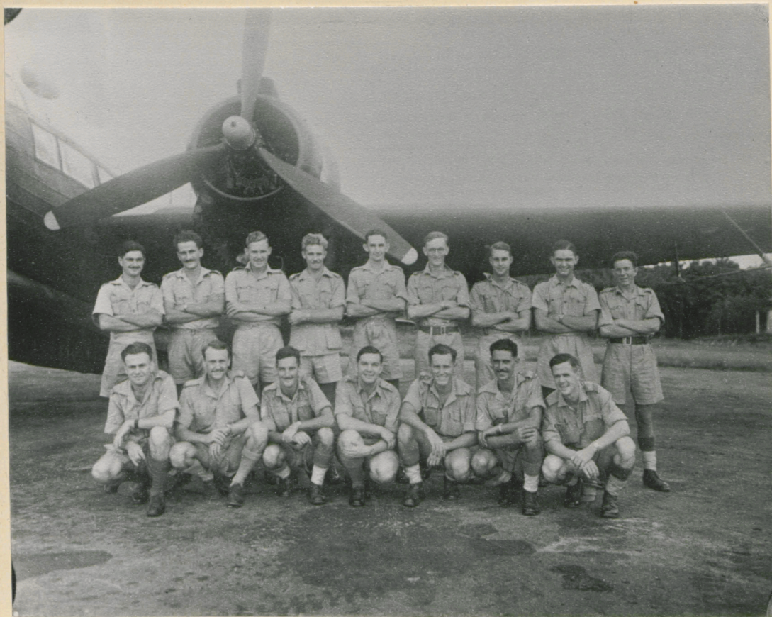
SQUADRON RADAR DETACHMENT