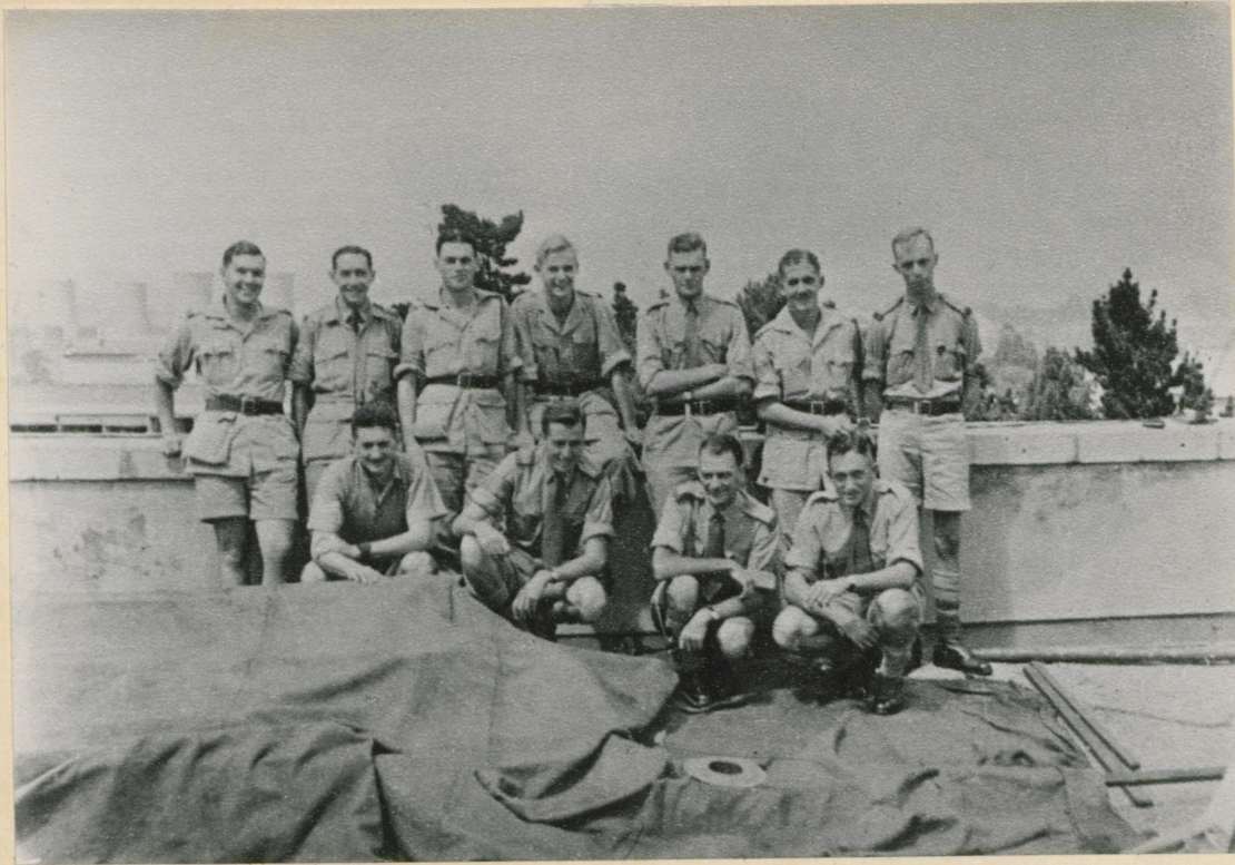
SECOND GRADUATE TECHNICAL TRAINING COURSE