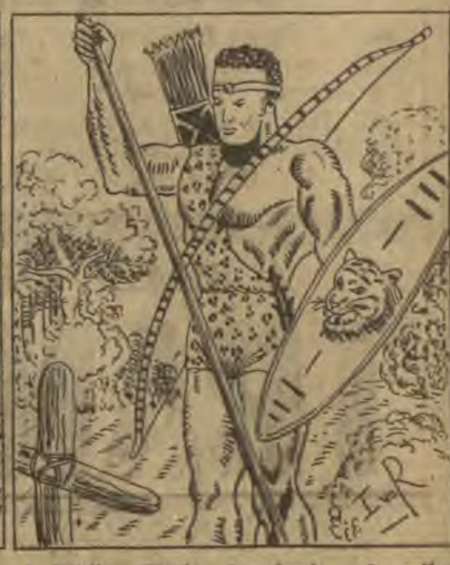
4. While Thala hundreds of miles away vows to revenge his people (Next week: Baboon Country)