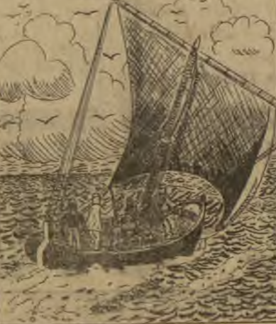
3. Not far away, unknown to the Arabs, a ship lies. A ship owned by the warlike cannibals of Uglide which will play an important part