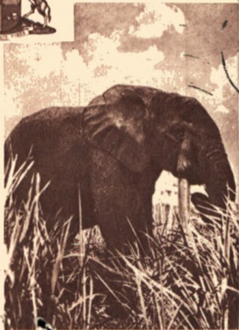
KRUGER NATIONAL PARK NASIONALE KRUGERWILDTUIN