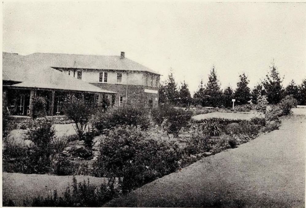
BRIDGMAN MEMORIAL HOSPITAL.