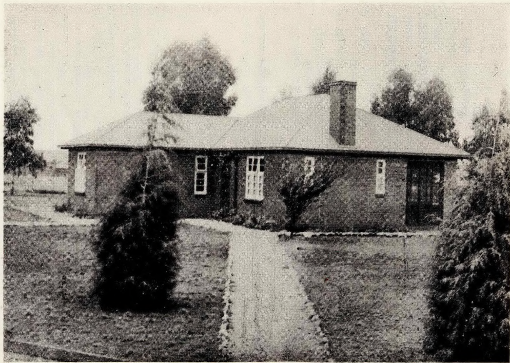
NEW COTTAGE FOR SUPERINTENDENT,