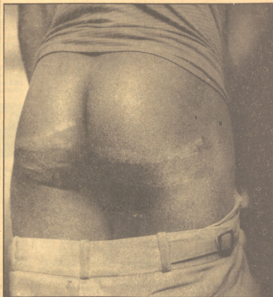
Red weals are left on the boy's buttocks after the caning.