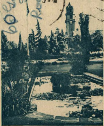
GOEW. GEBOUE—GOVT. BUILDINGS BLOEMFONTEIN