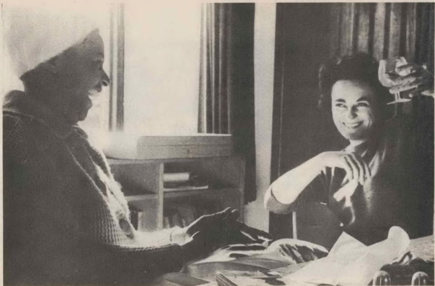
With Winnie Mandela