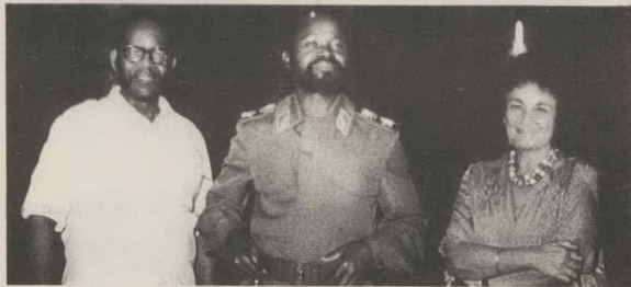
With Presidents Machel and Tambo