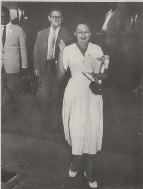
Treason Trial — 1956

of Southern Africa Tyneside AA Group—UK Workers Party of Ireland Working Group Kairos—Netherlands Women and Development—Denmark World Council of Churches Programme to Combat Racism World Peace Council World University Services—Denmark Yugoslav Embassy in Mozambique □□□□