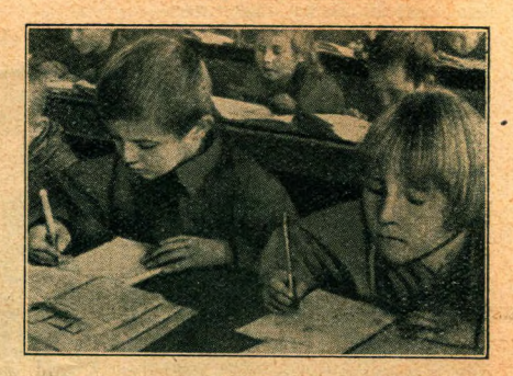
African children on a coffee plantation in Kenya. Children of the plantation owner in School.