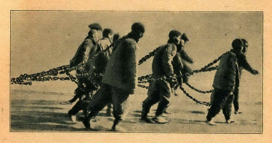
Help the Chinese Workers Break their Imperialist Chains.

At present the French system, which, set up at Versailles, included the Eastern countries of Europe, has now been extended to include Japan. The agreement