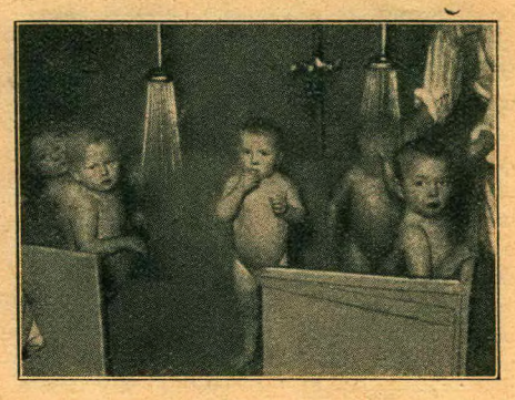
Workers' children on the streets of Accra, Gold Coast. European children in a Kindergarden.

The workers of all countries must voice their indignation and protest against this outrage. They must refuse to allow themselves to be used as soldiers in murdering each other in the interest of these imperialist robbers. The African workers, whose lands have already been stolen by these same imperialist enslavers must unite with the Chinese masses for the overthrow of the whole system of imperialism. Only the unity of the workers of all races and colours can lead to the freedom of the oppressed peoples.