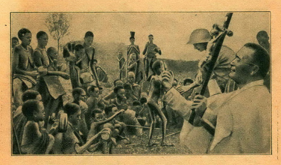
Missionary Recruiting Child Labour in French Congo.

Babies and infants sleep or play on the floor while their mothers work by the matchmaking machines.