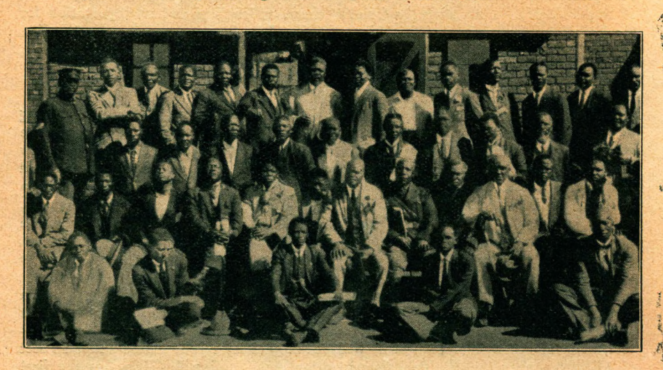
Conference Group of the South Africa National Congress.

Urged on by the ultra-reactionary Afrikanders, Pirow finally decided to raid the native compounds and in the latter part of November wholesale raids were carried out by the armed forces of the state with the aid of gas-masks and tear gas-bombs. Over 600 natives were arrested. These raids had the effect of driving over some of the reformist Native leaders into the militant campaign. Pirow wanted to increase European fears so as to enable his party to railroad through Parliament legislation, depriving the Africans of the freedom of speech, assembly and of the right to organize. In this he succeeded.