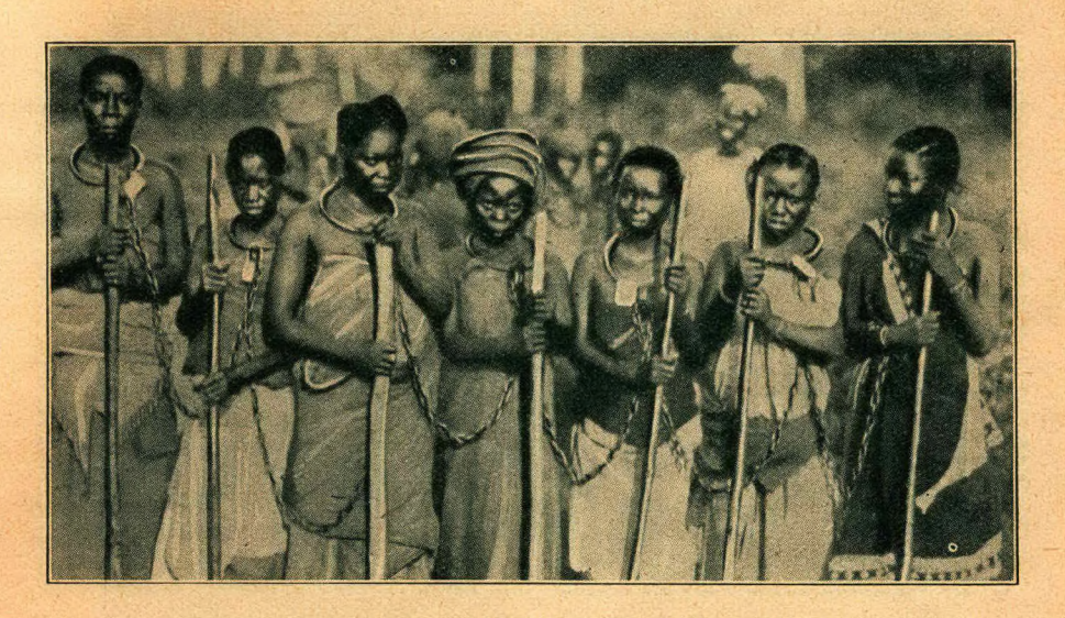
Forced labour in British West Africa.

Aborigines (full or half caste) who take part in politics are subject to the vilest of terror, denied the right to live, and threatened with having their children taken from them, and they themselves with being gaoled for "cattle stealing" or any other charge that may be considered necessary.