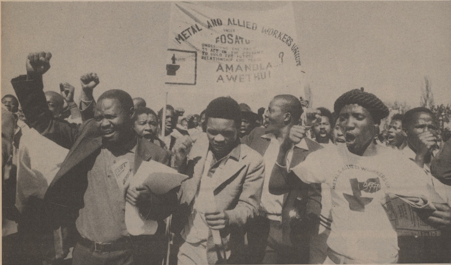
Ngokukhulu ukuziqhenya amalunga eMAWU athwele iflegi lenyunyana ayongena kwi-AGM

U-FOSATU wexwayisa iCiskei ngokuthi ayisoze yayinqoba 'lempi' eyilwayo nabasebenzi.