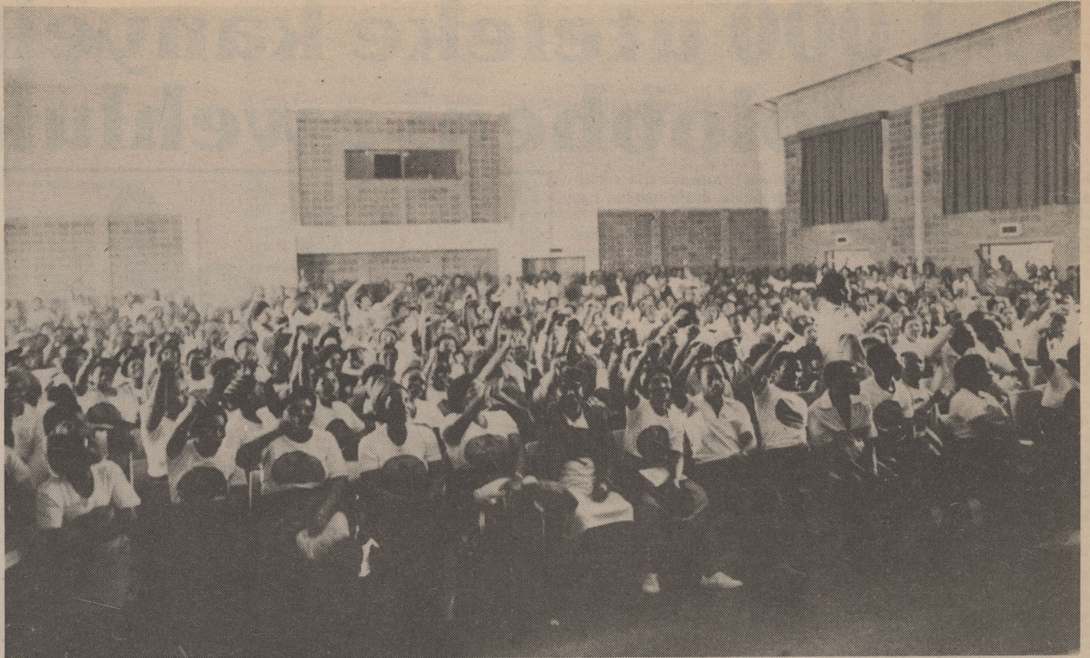
Abasebenzi bakwaFrame bejabulela ukuzwa ukuthi seyize yakhethwa iConciliation Board.

I-NUTW iyobuyela itshela inkantolo ukuthi uFrame wayevume kanjani ekuqaleni ukuyamukela efekhtri ngayinye uma seyineni ngi.