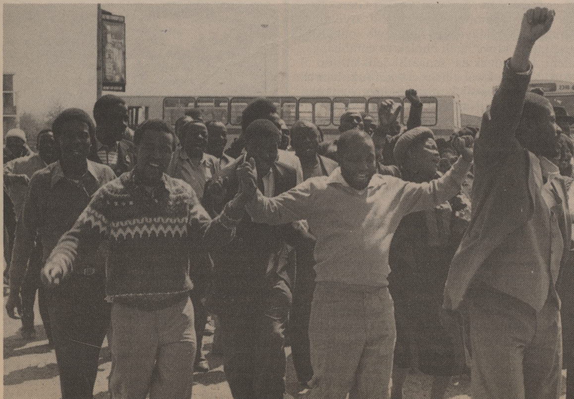
Abasebenzi beChemical bavuma ingoma bephikelele emhlanganweni

Kulesivumelwano esisha, abasebenzi bakwaMercedes bazobuyebathole imali yeminyaka ewu 10c nge-awa kulabo asebeneshumi leminyaka uma befika ngesikhathi emsebenzini.