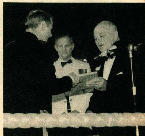
Tydens Weermag (WP) Rugbyklub se prestige bokstoernooi is dr Danie Craven vereer vir sy bydrae tot Weermagrugby. Hier oorhandig genl Jannie Geldenhuys die eerbewys aan dr Craven.

Dr Craven is op 1 April 1938 as organiseerder van liggaamlike opleiding in die Unieverdedigingsmag met die rang van luitenant aangestel. Toe hy sy uniform in 1949 vir 'n professortoga verruil het, het hy die rang van kommandant (destyds luitenant-kolonel) beklee. Deur dié verbintenisse het hy steeds 'n sagte plekkie vir die Weermagmanne.