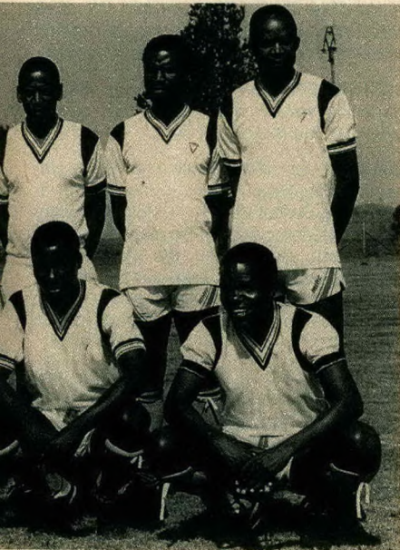
21 Battalion's soccer team playing in the A Division.