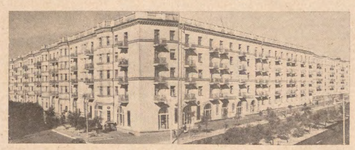
A new block of flats in Staling rad, reborn from the ruins of the war.

After a few moments the lid is lifted off again, and out jumps a little boy, dressed exactly as the factory manager. Not only the cloth but the man himself had shrunk!