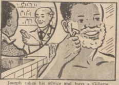
Joseph takes his advice and buys a Gillette No. 5 Set, and 2 Blue Gillette Blades—only 1/6. He was amazed to find them so sharp for so long.