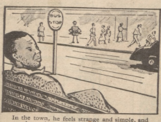
In the town, he feels strange and simple, and wonders why people seem to laugh at him. Sadly he sits down to think.