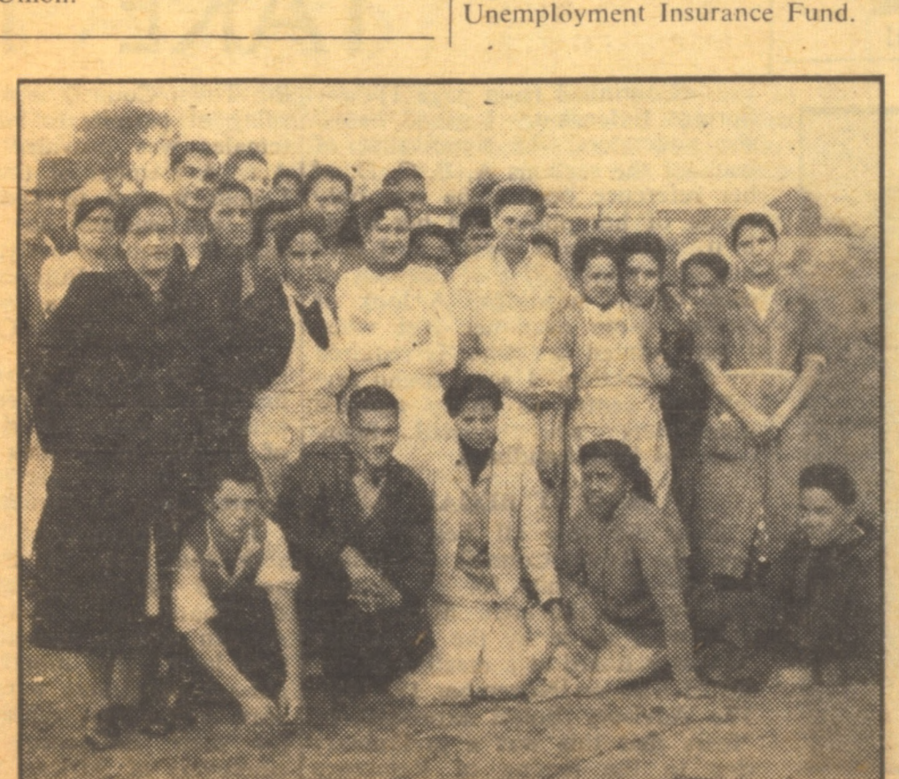
Some of the unemployed tin workers photographed outside the factory last week.