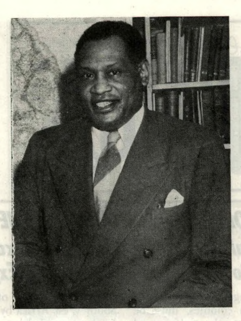
Paul Robeson, Chairman of the Council on African Affairs, addressing the conference of organization leaders called by the Council on October 16 to secure the fullest cooperation in pressing for U.N. action in behalf of African freedom.

tion next took place in the sub-committee to which this question was referred. Having lost the first round and the hope of getting approval for annexation at this session, General Smuts is now quite willing to follow the veiled suggestion of the United States that decision be deferred until a later date.