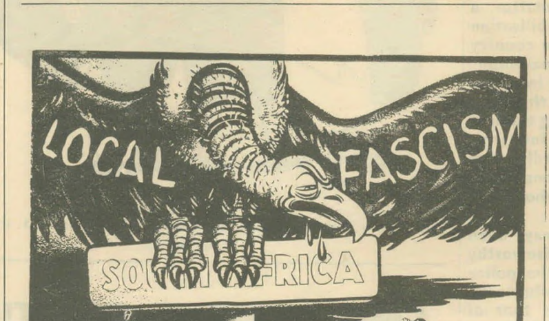
Dont' look now, pal, but you're being followed.

with the big farmers. TYPICAL CASE The Minister of Native Affairs and the Director-General of Demobilisation have been requested to intervene on behalf of these men. As this case is typical of the treatment meted out to African ex-volunteers in the rural areas, particularly where the anti-war elements are strong, the action taken will be a good guide action taken will be a good guide as to whether or not the Government is prepared to live up to its promises. It is intolerable that the freedom of ex-soldiers should bute to an improvement in the