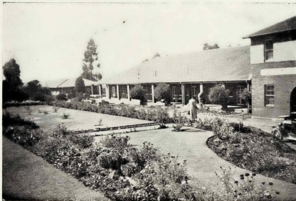
BRIDGMAN MEMORIAL HOSPITAL.