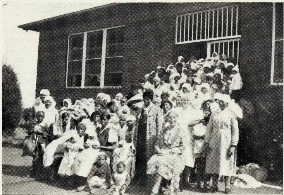
THE SATURDAY MORNING BABY WELFARE CLINIC.