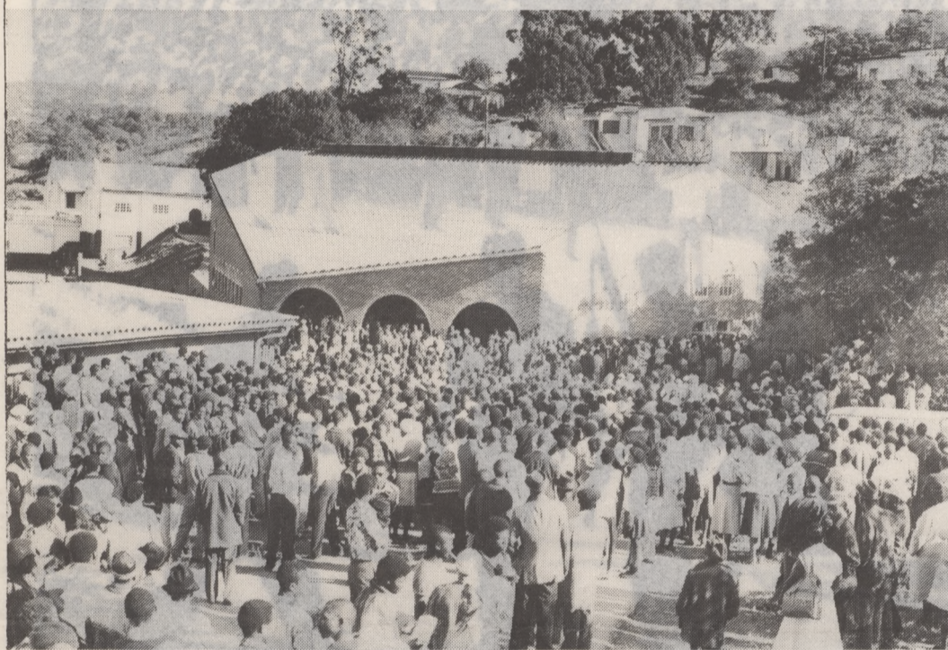
UMHLANGANO WABASEBENZI BAKWA-FRAME - 28 MAY.

U-FOSATU wazama ukusiza i NUTW okuyilunga lakhe kanye nabasebenzi. Sabe sesazisa abasebenzi esikanye nabo abakwamanye amafekthri kanye nezinye izifunda mayelana nobekwenzeka. Sazama ukuvimba ukuba abasebenzi bangehlukani swa futhi saxhumana nezinhlango zabaqashi kanye noHulumeni ngenjongo yokuchaza ukuthi isimo sasibucayi kangakanani.