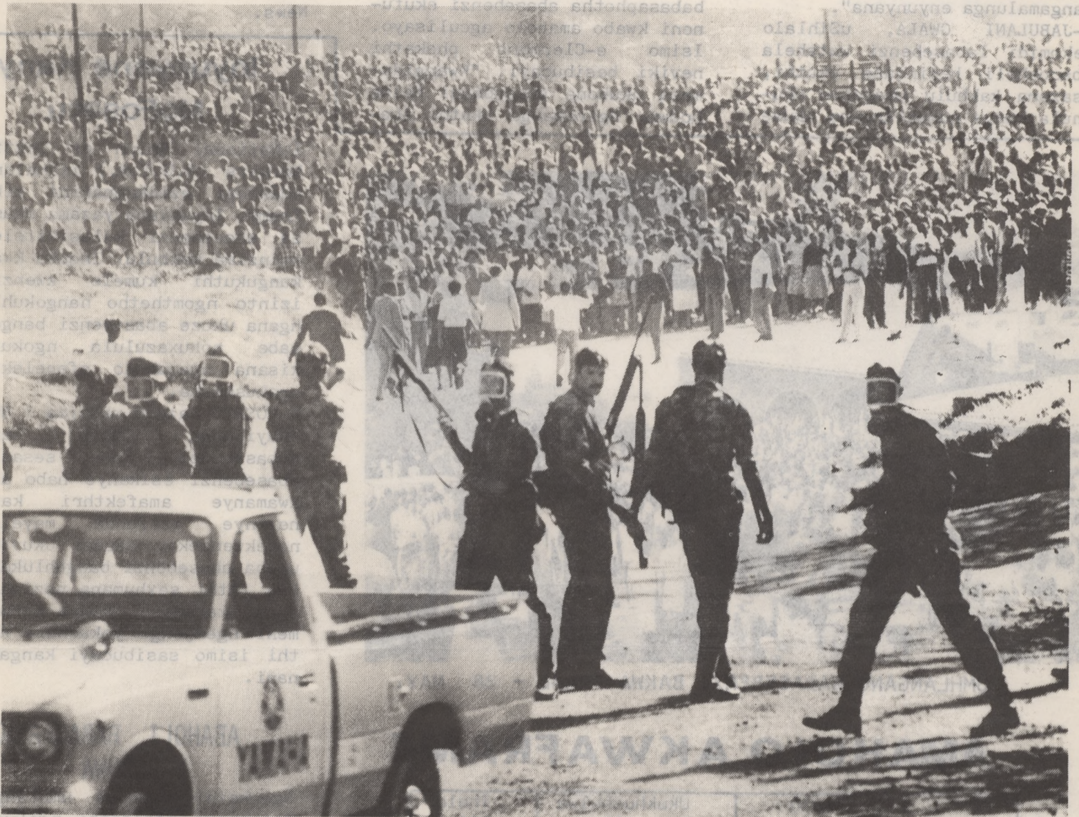
ABASEBENZI BAKWA-FRAME BANQWAMANA NAMAPHOYISA BELANDE AMAHOLO ABO - 22 MAY.

Esidekazi nesikhulukazi kanye nesibucayi isiteleka emlandwini wase Phayindane sipelele izolo.