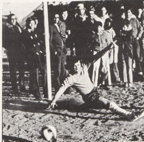
Queen's Park where the premier national amateur competition was played in 1972.

Slowly but surely, times are changing for our sportsmen. This Datsun tournament will be played on reasonable turf grounds, there is ample sponsorship and adequate seating facilities for spectators.