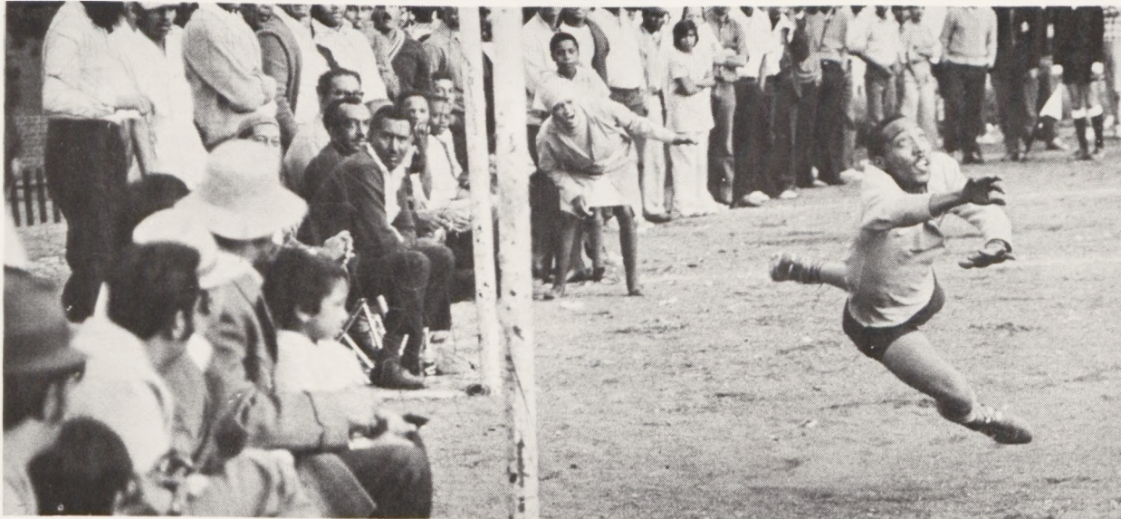
QUEENSPARK - VREDEDORP

Things must come right, as, indeed, they will. One day we will play sports free of politics, bitterness and sectionalism.