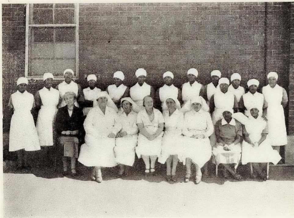
THE RESIDENT STAFF