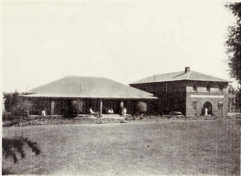
BRIDGMAN MEMORIAL HOSPITAL.