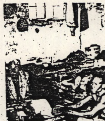
We demand the right to live with our families

We demand the abolition of the pass laws, the Citizenship Act (which deprives the African people of their birthright) and the abolition of the migratory labour system and demand the right to live with our families anywhere in South Africa.