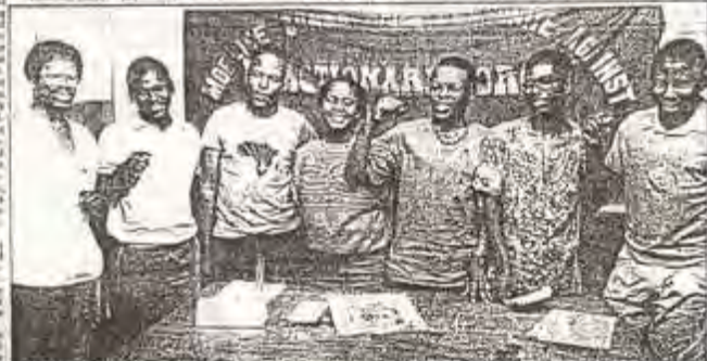
MEMITERS of the pe

deades to him the # Coyles of Journ $1.70, as position Rom the FAC other 212 Church Bress chart SIWLO