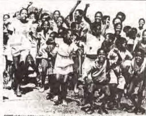
SCHIEF of those children (above) may not have been bush on March 21 1980 when the Charpert shouldings occurred, but this did not stop them from joining drosse of people who word to the board graveyard pesterday to claim the graves of the visit

Among Copposition type-street by the MCC error for Assault Coverbasing Committee, July on Taularia Marsense African Semoly Department of Netsmal Council of Tech-Colors, African Adrid Worker I band and Assemin Marinari Toom Units.