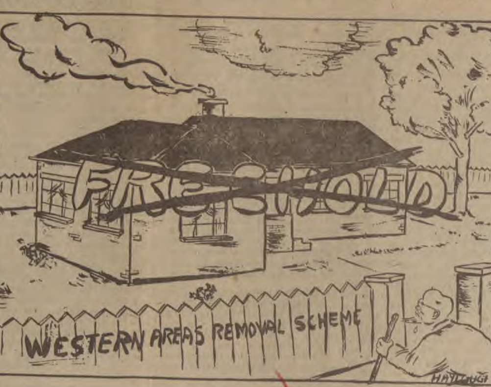
WESTERN AREAS REMOVAL SCHEME