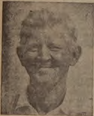
Makholo a mangata a batho a fumane thuso ka ho sebelisa B.B. Tablets...

Ha u tsoa ke ramathole, le liphio le sebetse, u as le molikokokane, liphio tse hantong ho sebetse, senya se fokolang, liphio tsa hloekiso, joalo joalo.