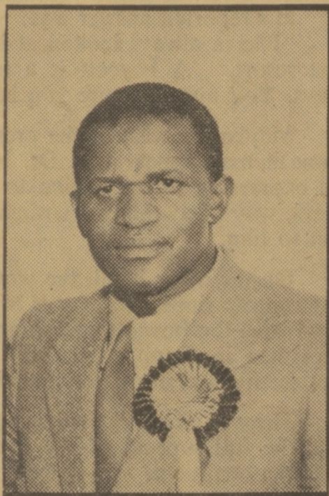
"Basutoland is now the Jerusalem of all African refugees," said Mr. Ntsu Mokhehle, Leader of the Basutoland Congress Party, to the applause of a packed hall during the conference of the B.C.P. in Maseru recently.

ON JANUARY 20 THE PEOPLE OF BASUTOLAND WILL GO TO THE POLLS FOR THE FIRST TIME IN AN ELECTION WHICH WILL BE THE FIRST STEP TOWARDS THE ESTABLISHMENT OF A LEGISLATURE IN TERMS OF THE NEW CONSTITUTION.