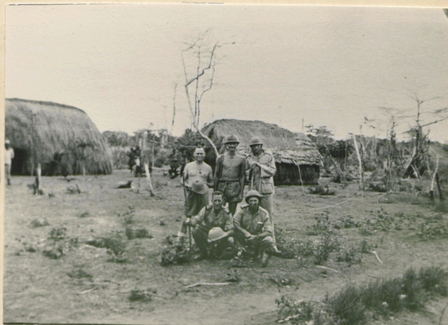
TYPICAL SCENE NEAR MAMBRUI

At this stage, special radar transmitting valves had become available at the Bernard Price Institute and work commenced on J.B. 2, in which these valves were incorporated. This set was sent up to operate on a second site in East Africa.