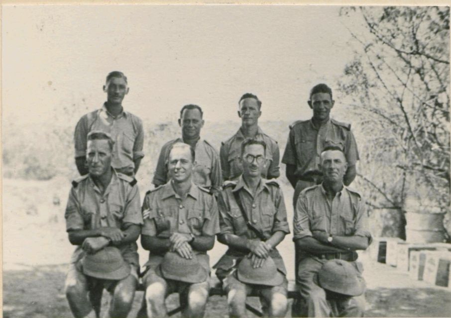
The station crew at the first S.S.S. RADAR STATION at MAMBRUI, on the EAST AFRICAN COAST.