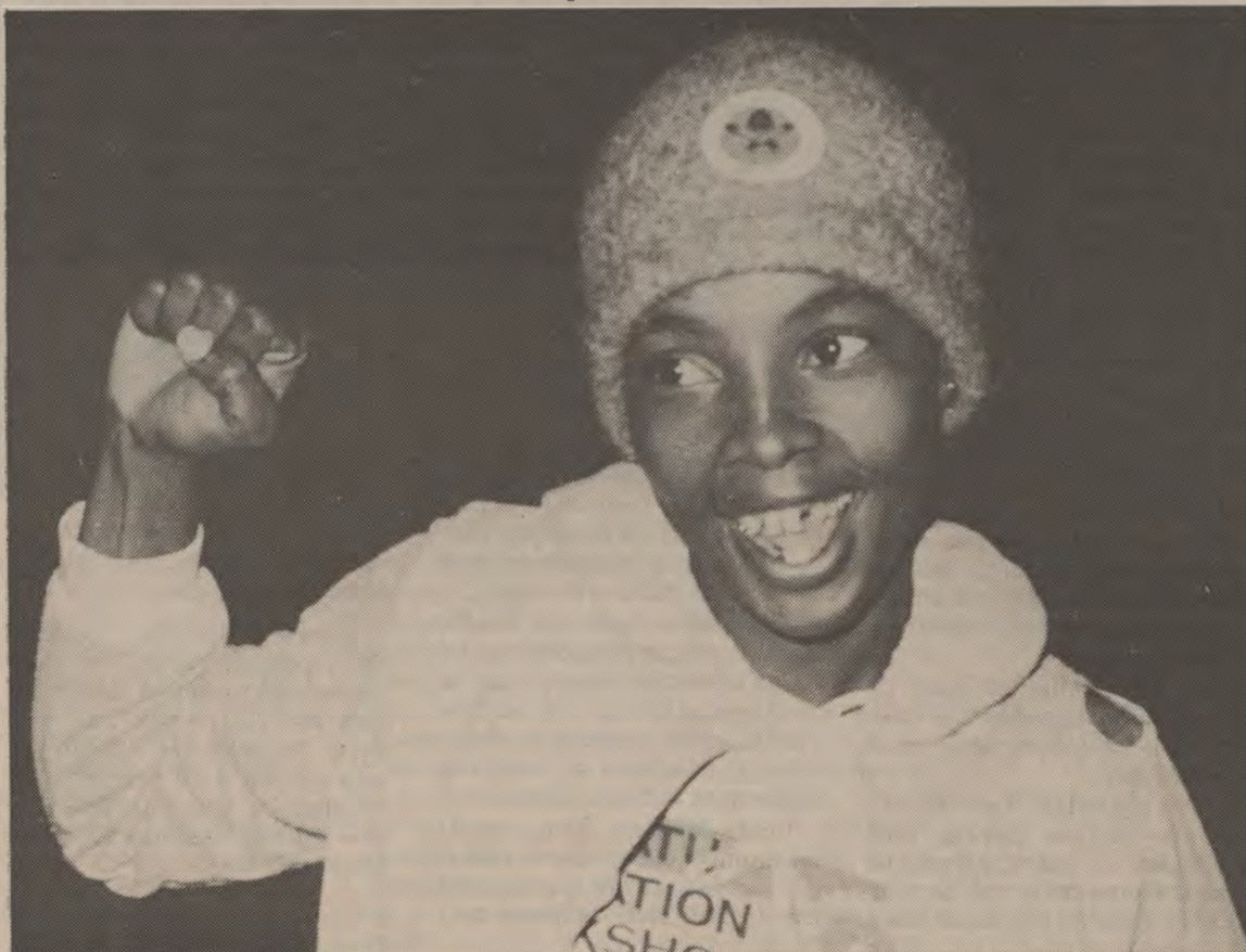
An elated Frame worker

No doubt they will be the second Frame mill to march to the company's door and demand recognition of NUTW.