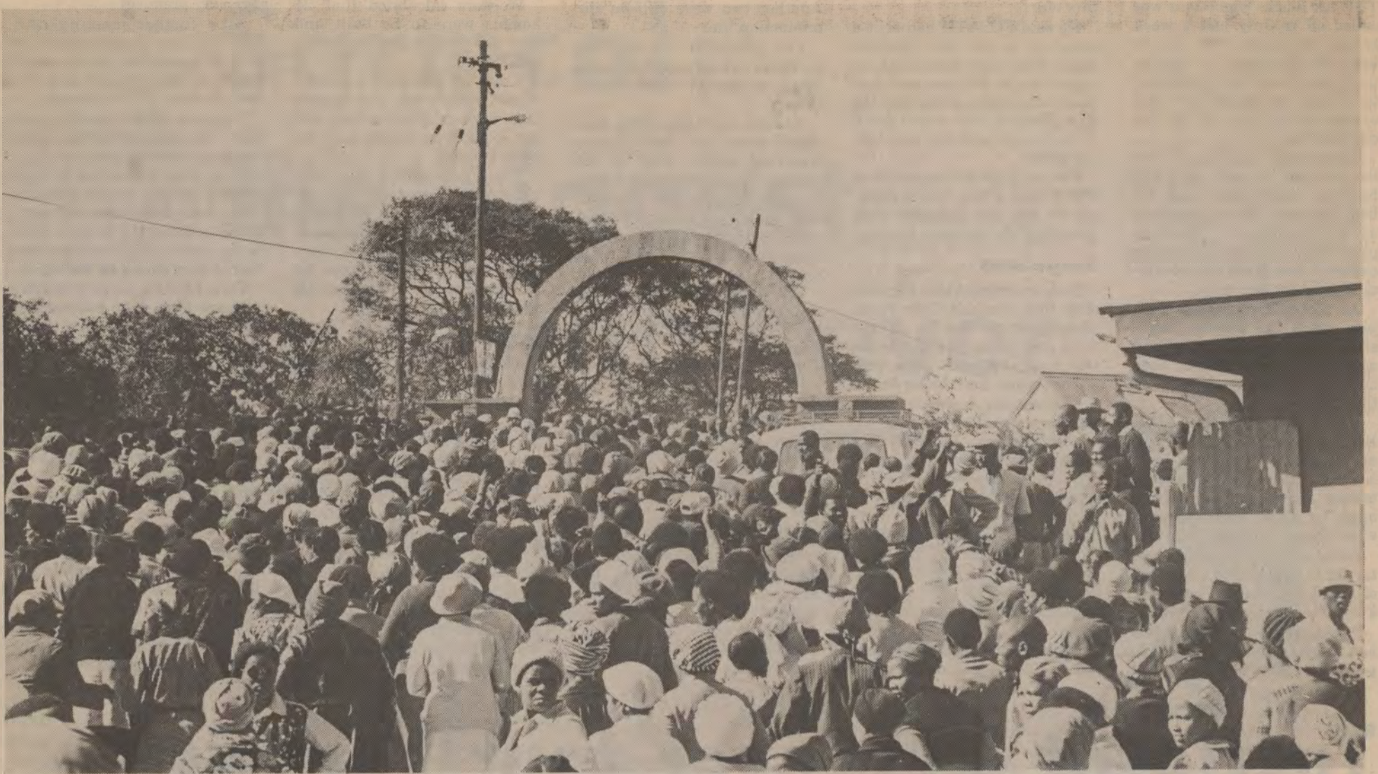
Flashback: The 1980 Frame strikes