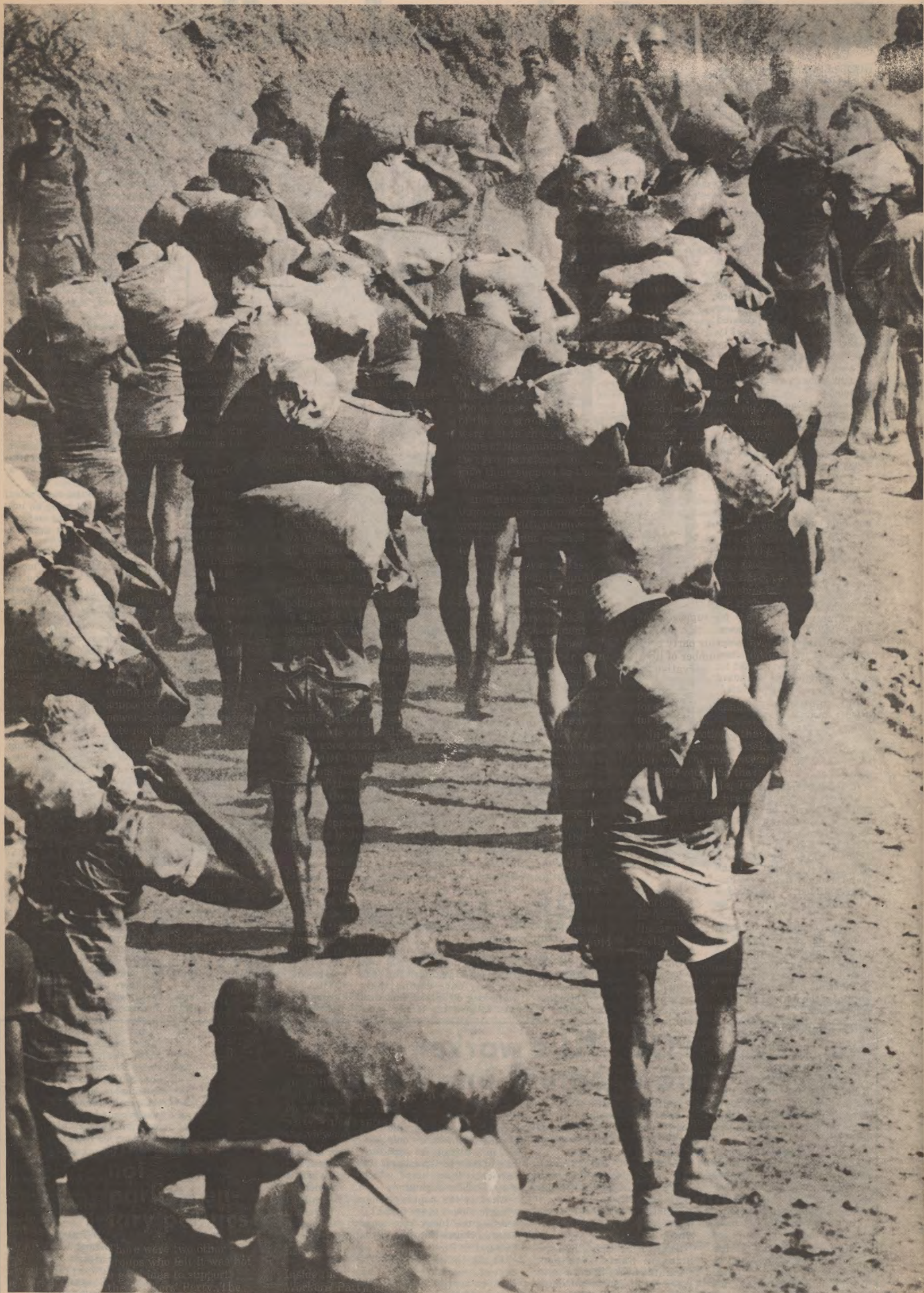
Brazilian workers carry sacks of gold bearing rock at the Serra Pelada open cast mines. Over 50 000 workers work under appalling conditions at these mines in the Eastern Amazon.