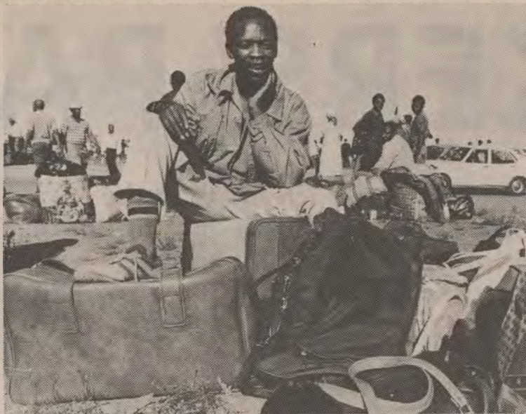
Flashback: One of the many Sasol workers waiting to be bused back to the homelands last November

In the wage talks, CWIU argued that management should not give a percentage increase as this would only widen the