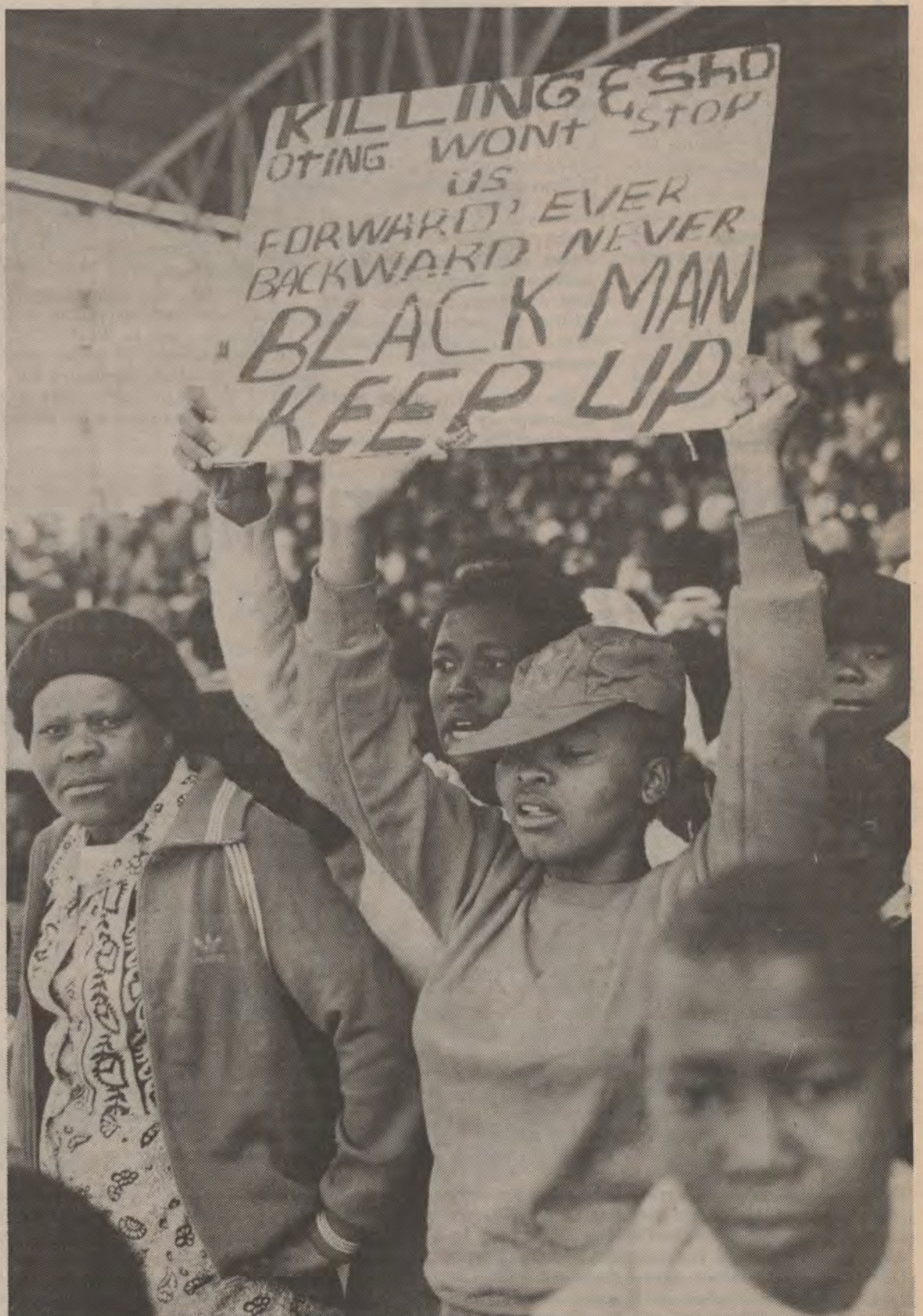
The message is clear, but will anyone listen to it? — an NUTW member waves a placard at the KwaThema funeral

The credentials committee will also assist unions in taking steps towards merging with other unions in the same industrial sector so that in the near future there will be only one union for each sector.