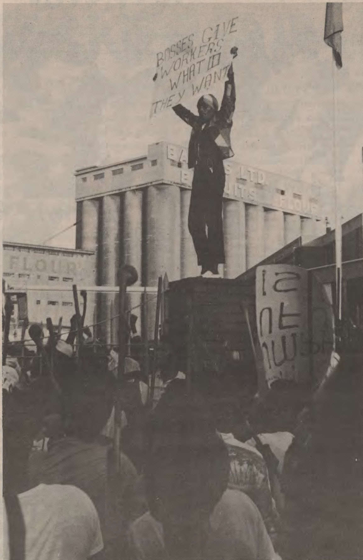
Clover Dairy's workers and the B B Bread strikers meet at the factory gates

Workers in South Africa have begun to organise and in this there is hope, as the K Team from Kellogg's sings, 'But now we have a representative.