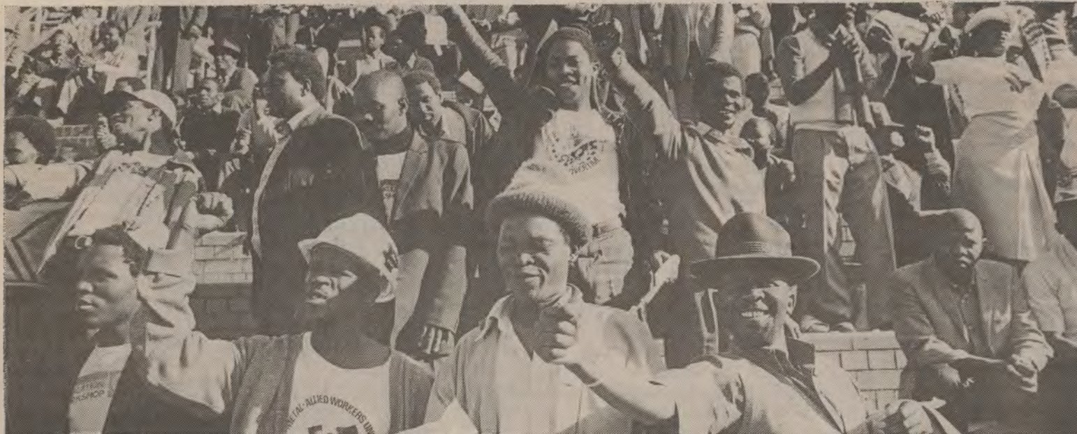
MAWU members at the unions' Annual General Meeting — at this meeting they rejected Seifsa's wage offer

MAWU has declared a dispute with the company and will be taking court action against it for its unfair actions. The union has also raised money to help support the strikers and has handed out food parcels.