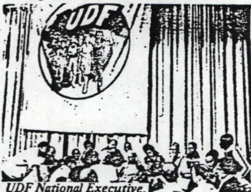
UDF National Executive.

We must move ahead after August. We must redouble our efforts to build the power of our democratic organisations. We must bring in more people. We must develop more organisers and more fighters for a free South Africa."