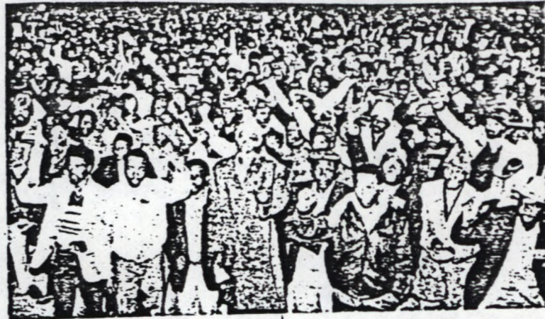
Terror Lekota addresses anti-election rally.