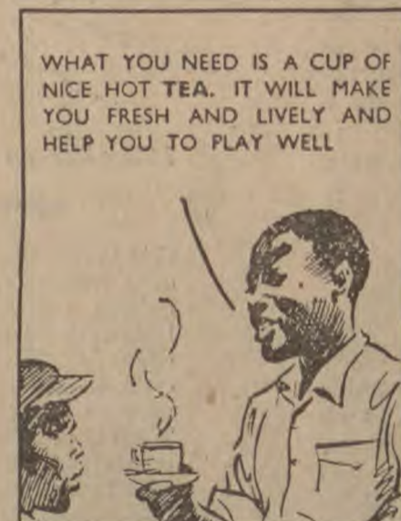
WHAT YOU NEED IS A CUP OF NICE HOT TEA. IT WILL MAKE YOU FRESH AND LIVELY AND HELP YOU TO PLAY WELL