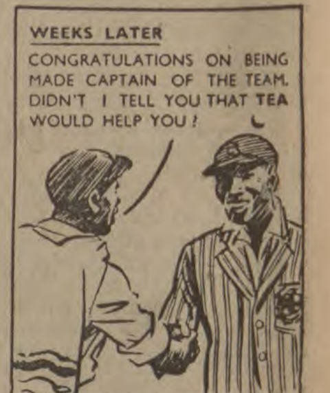
WEEKS LATER CONGRATULATIONS ON BEING MADE CAPTAIN OF THE TEAM. DIDN'T I TELL YOU THAT TEA WOULD HELP YOU!

Tea is easy to make and costs very little. When we are tired, a cup of Tea soon makes us fresh and strong again. Everyone likes Tea, it tastes so good. Both children and older people should have Tea with every meal and when they are tired and thirsty too.