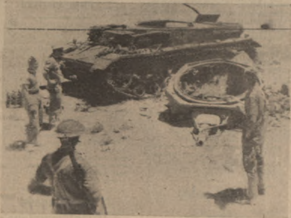
Although heavy fighting is in progress in Egypt there has not yet been a major battle between Panzer and British tank divisions. Here British troops in Egypt are standing by a German medium tank still burning.