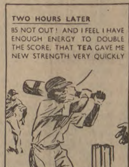
TWO HOURS LATER 85 NOT OUT! AND I FEEL I HAVE ENOUGH ENERGY TO DOUBLE THE SCORE. THAT TEA GAVE ME NEW STRENGTH VERY QUICKLY