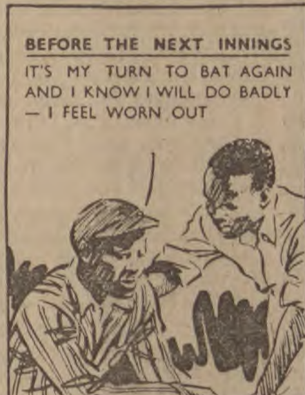
BEFORE THE NEXT INNINGS IT'S MY TURN TO BAT AGAIN AND I KNOW I WILL DO BADLY — I FEEL WORN OUT