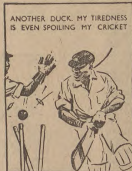
ANOTHER DUCK. MY TIREDNESS IS EVEN SPOILING MY CRICKET