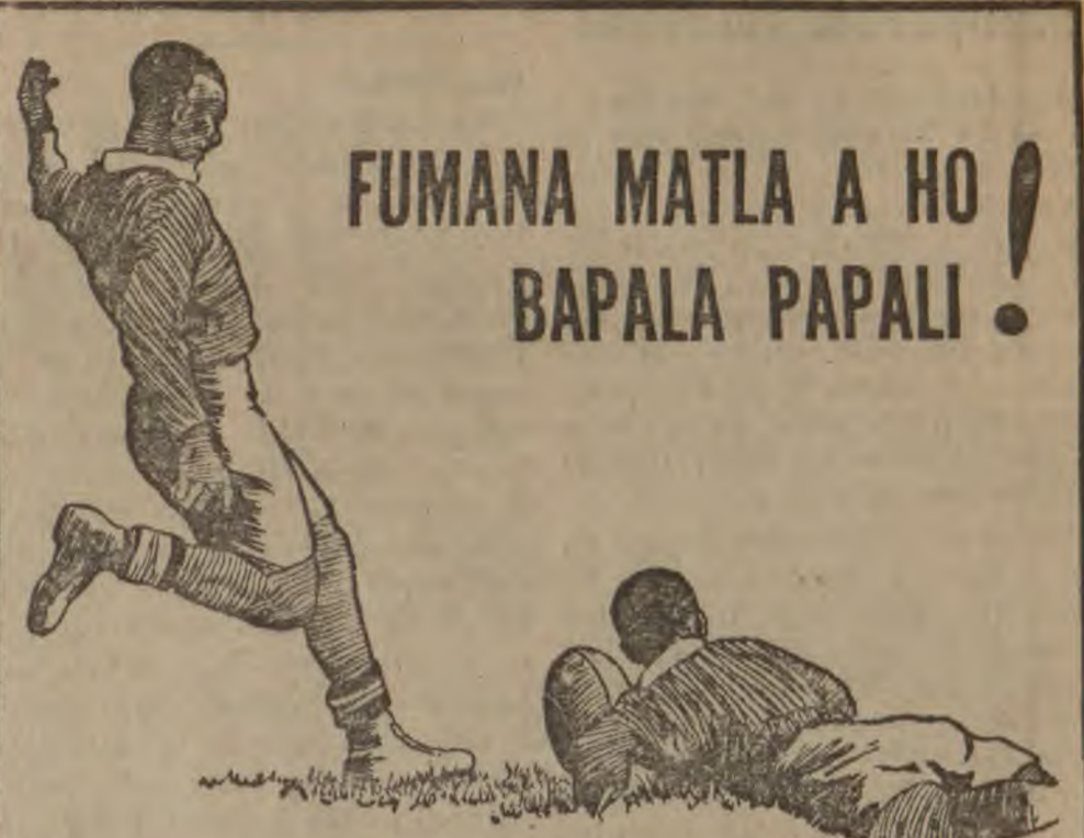
Rugby—O raha ho etsa Goal.