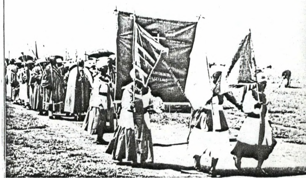
Swazi Zion churches: same occasion.