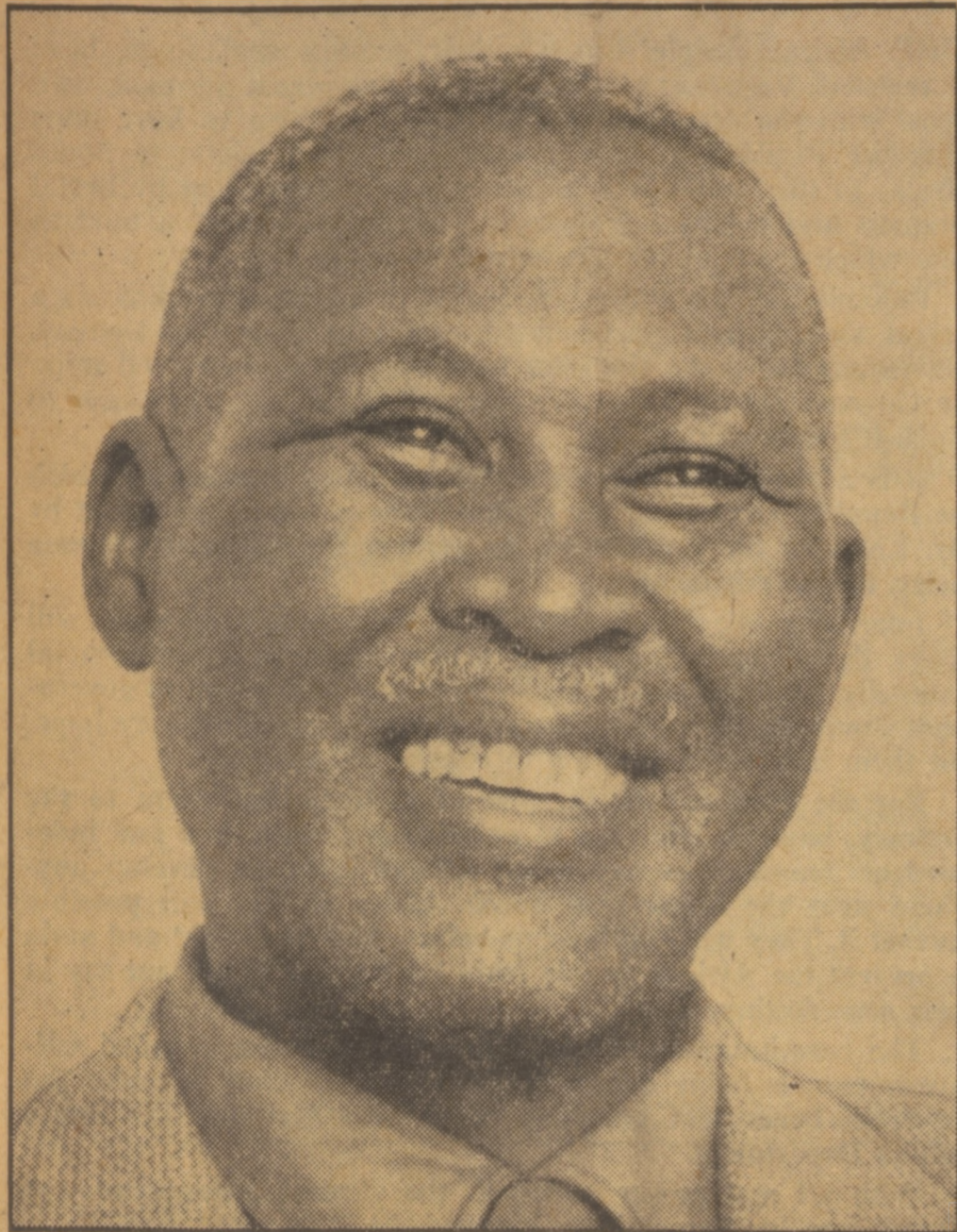
CHIEF ALBERT J. LUTULI