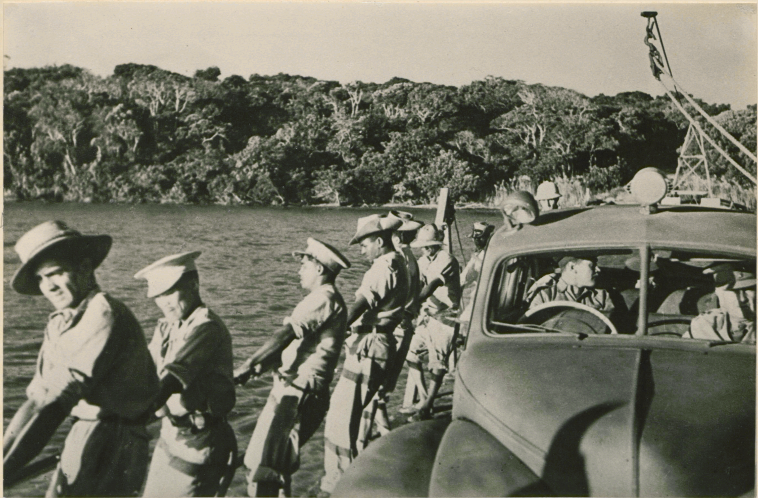
SOMETIMES THE "ROAD" WAS A WATERWAY