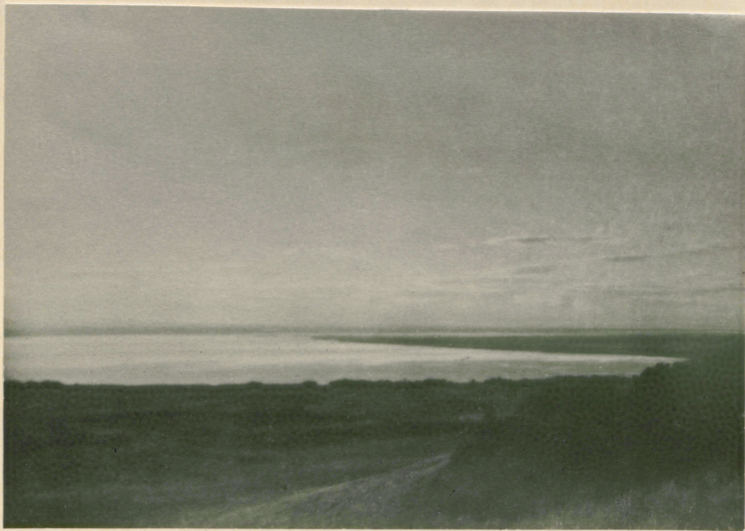
THE STATION CREW AT A STATION NORTH OF ST. LUCIA BAY WERE REWARDED BY THIS VIEW.