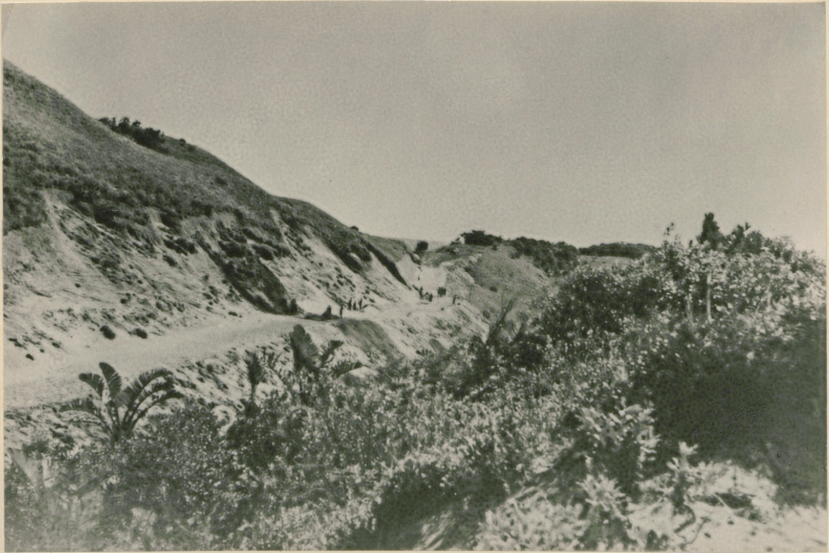
ACCESS ROADS OF THIS TYPE, BUILT ALONG SAND DUNES, WERE VERY COMMON