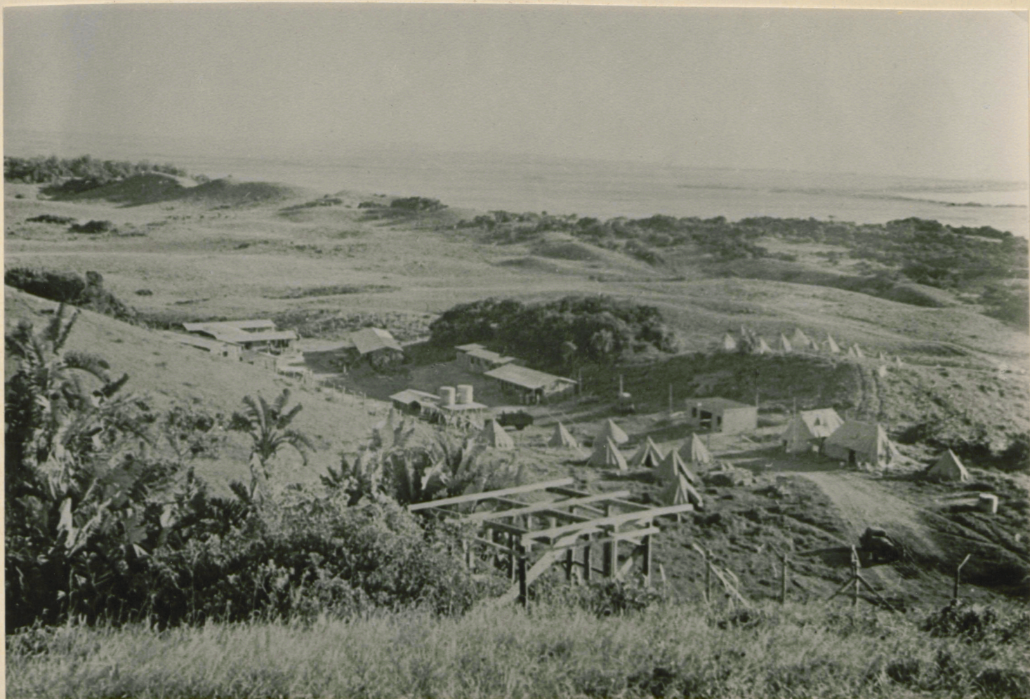
CAMP UNDER CONSTRUCTION NEAR RICHARDS BAY ON THE ZULULAND COAST