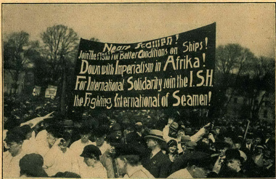
International solidarity with Negro Workers, 100,000 workers demonstrating at Hamburg, Germany, for international solidarity and against imperialism in Africa.

However, if war breaks out, the Negroes must line up on the side of the revolutionary front and use the arms which their white oppressors put in their hands