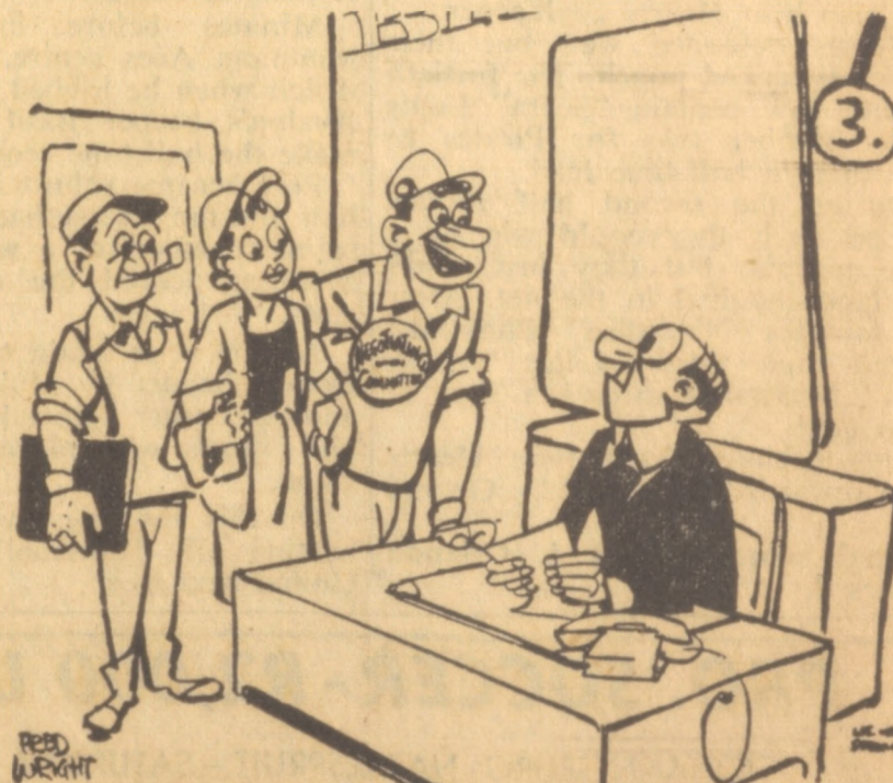
Okay, we'll stop asking for a shorter work week . . . how about a longer weekend?"