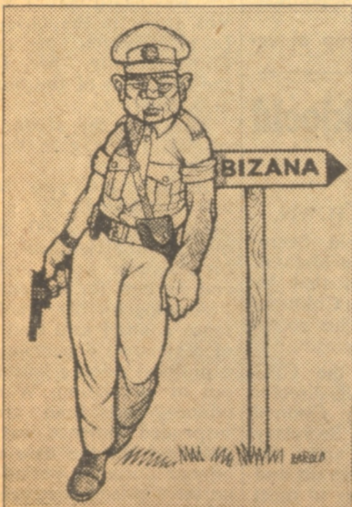
"O vat hom terug na die ou Transvaal."