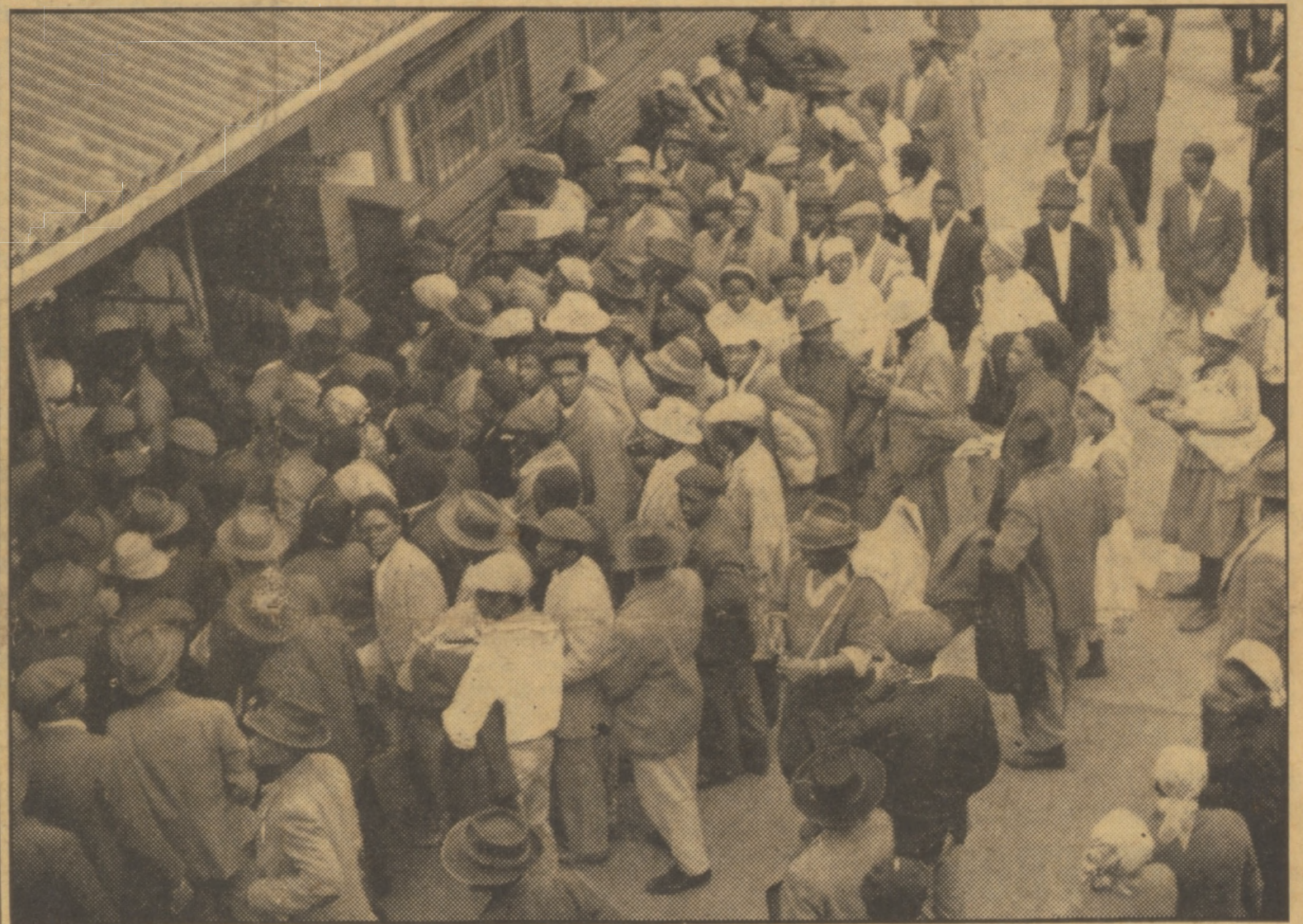
The stoppage of the bus service at New Brighton has diverted so many people to the trains that the apartheid regulations have been suspended.

"During yet another raid the (Continued on page 3)