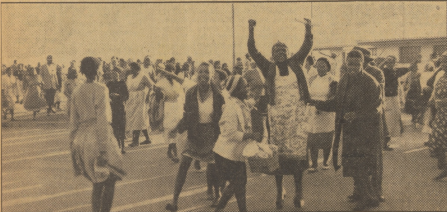
Part of the crowd of 2,000 women and men who demonstrated at the Port Elizabeth Location Manager's office when they found the Bus Manager out. The bus depot is next to the Labour Bureau.