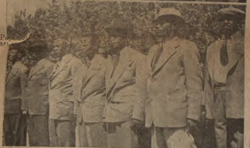
TOP: The hearse carrying General Smuts' coffin passing through the crowded, silent streets of Johannesburg. (See also page 3)