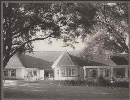
Liliesleaf historic guesthouse (Manor House)

The Liliesleaf Trust has been established to ensure that the unique heritage, history and legacy of Liliesleaf Farm is preserved. The focus is to preserve the historic buildings and the activities which took place on this significant site, to ensure that the essence, spirit and soul that Liliesleaf Farm embodies are maintained for current and future generations.