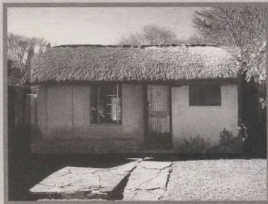
Thatched cottage and outhouse buildings at Liliesleaf where liberation struggle activities were planned

It is anticipated that the historical precinct will be declared, by cabinet, a Legacy Project.