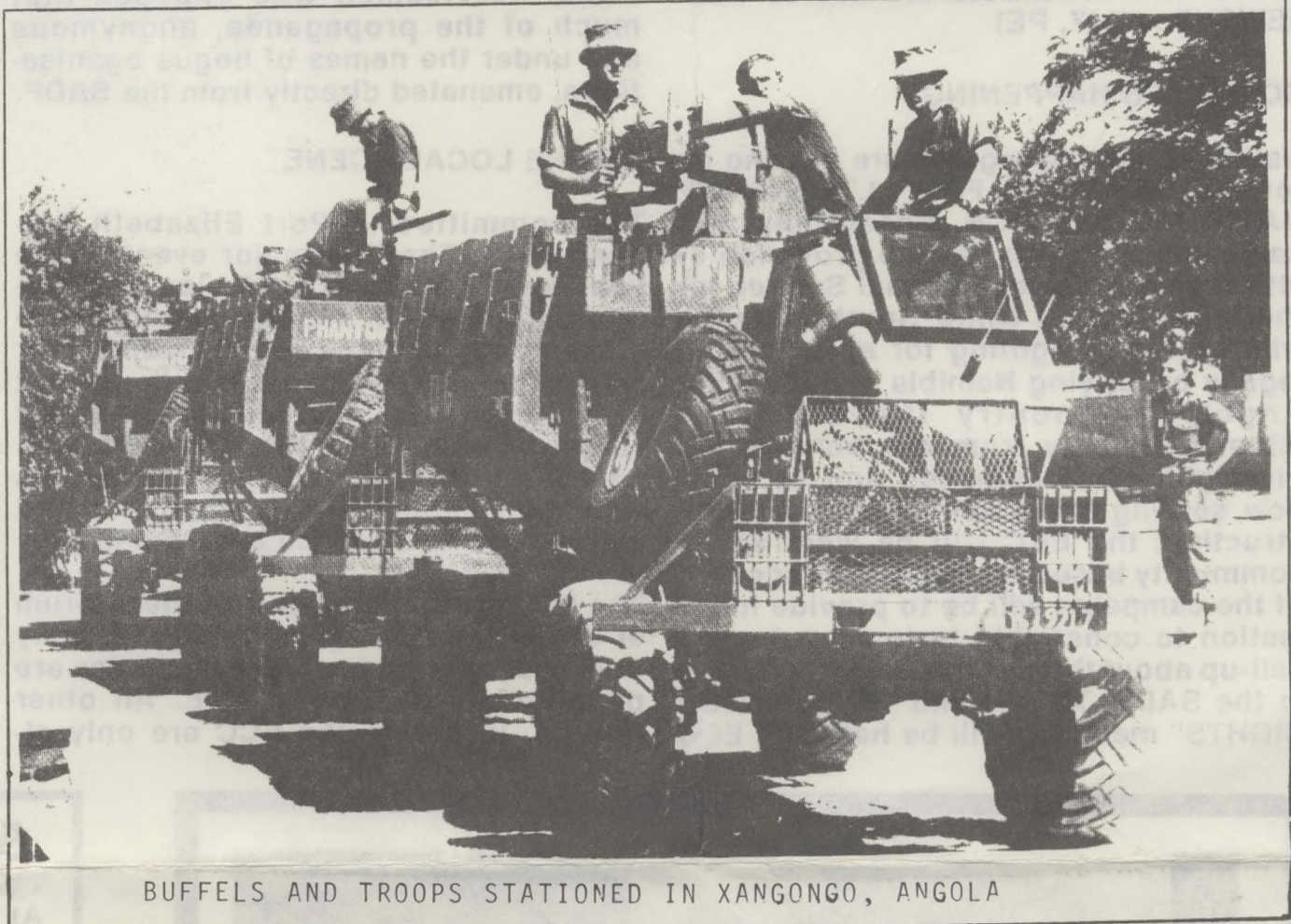
BUFFELS AND TROOPS STATIONED IN XANGONGO, ANGOLA

The fighting in Angola has exacted a spiraling toll of losses. Angop, the Angolan news agency has claimed that the South African forces have suffered the