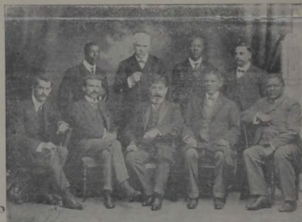
T. M. Mapikela D. D. Ndwanya W. F. Schreiner F. T. Fredericks J. T. Jabavu Dr. W. B. Rubusana P. Hendricks Dr. A. Abdurahman

Led by W. F. Schreiner, Ex Prime Minister