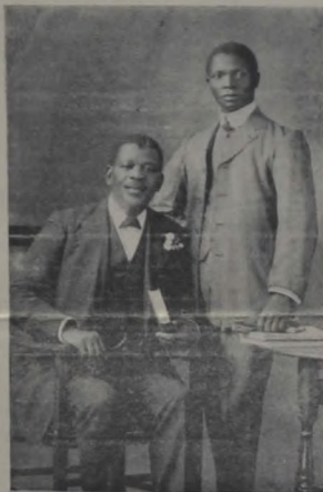
Dr. W. B. Rubusana Adv. Alfred Mangena