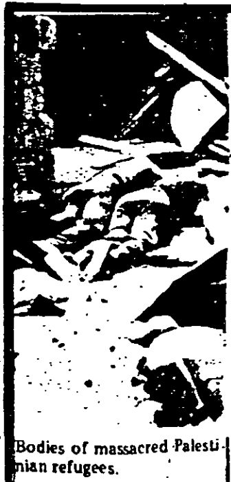
Bodies of massacrred Palestinian refugees.

'On behalf of the African National Congress and the struggling people of South Africa we hereby wish to express our deep anger and revulsion at the cold-blooded murder of hundreds of Palestinian refugees in Beirut during this past week. The blame for this Nazi-type genocidal action must be put squarely at the door of the Zionists and their patrons, United States imperialism. In the face of this merciless and heartless campaign of terror, we reaffirm our staunch solidarity with the people of Palestine and their representative and leader, the PLO. We pledge our support for any international initiatives you may take to ensure that the assassins are punished, the Zionist Army of occupation is withdrawn from Lebanon and the safety of the people of Palestine is guaranteed. Through practical measures the world community must put a stop to Zionist banditry and urgently help translate into reality the inalienable right of the people of Palestine to their own Homeland. Please convey our deep felt condolences to the people of Palestine and to the relatives of the butchered martyrs of Beirut. OUR COMMON VICTORY IS ASSURED'