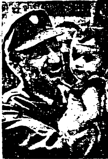
Yasser Arafat with a young Palestinian survivor from Israeli terror.

unjust and oppressive cause has drawn Zionist Israel and apartheid South Africa into a partnership of terror and aggression. Today they share military secrets, including secrets about how to produce nuclear bombs. They work to strengthen each other economically.