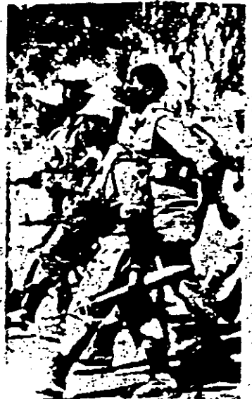
The gallant combatants of SWAPO, the Namibian people's

It is reliably reported that the Frontline States have communicated these views to the Reagan Administration. The U.S. government has been using various means and methods to force these states to agree to link up the Namibia independence question with the issue of Cuban troops in Angola. The Lusaka decisions therefore constitute a united, timely and decisive rebuff of the manoeuvres of the U.S. and its ally, apartheid South Africa.