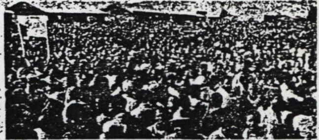
Vaal residents meet to express their demands