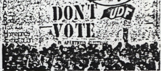
Our people did not vote for the tri-cameral parliament