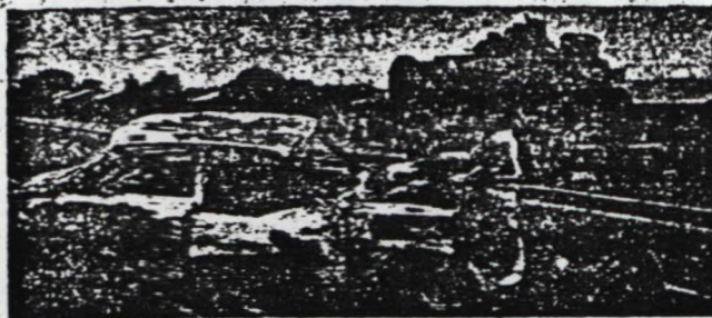
Armoured vehicles patrol Vaal Townships