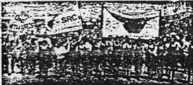
Throughout the country students are united in their demands for SRC's.