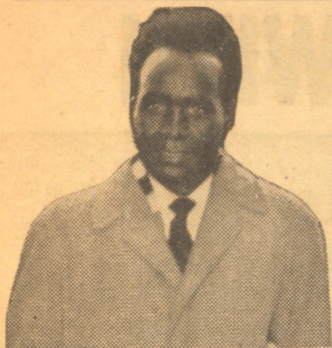
UNIP President Kaunda